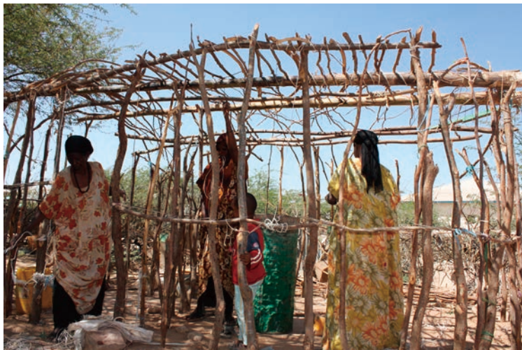
Fig. 1. Women building a Somali traditional house

localization. Are, for example, the Bantu Somali not local? What are their rights to the land and resources? Again, talking about people who are marginalized, the Bantu Somalis, suffer discrimination, marginalization and oppression. We heard today the comments of some Bantu Somali refugees (as presented to us by Prof. Seiji Utsumi [not included in this volume]) but also reflected by, I would add, this community in Maine in the US.