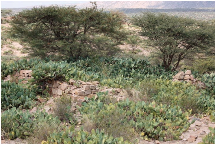
Fig. 3. Abbasa archaeological site and the town of Bon in Somaliland has been completely taken over by cactus

Another environmental problem that impacts the archaeology is the burning of charcoal. A Neolithic site of mixed landscape, natural as well as cultural, named Lukuud near Hargeisa, is also potentially important for tourism. It has lithic industries and rock art, yet, it also faces an environmental problem; people are cutting the trees in the site, and it impacts the site's class in the long term. Its landscape would probably no longer be identified as a mixed cultural and natural landscape. People are not only cutting its trees but also digging holes to burn charcoal in and that way also disturb the archaeological stratigraphy and material culture. The