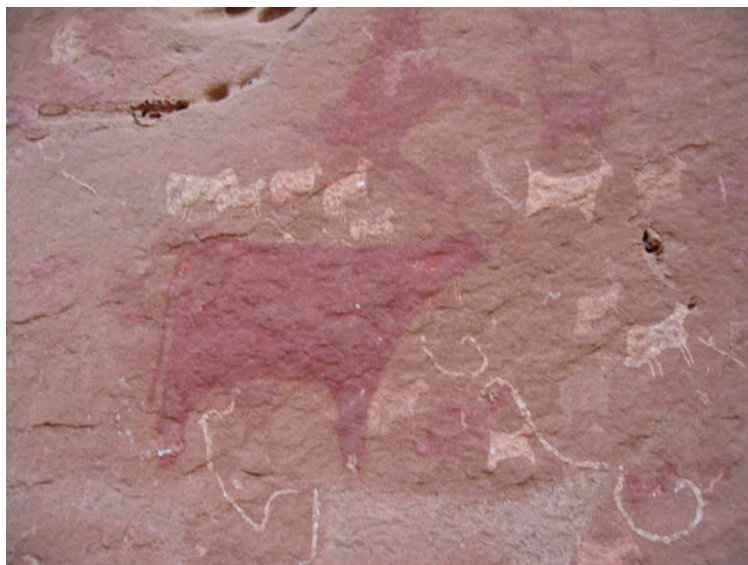
Fig. 2. Pastoralism dates back at least 5,000 years: Dhamblian rock art site

Again, when we are looking at these current regional problems, we have to look at the past—how people have been dealing with similar problems. All of the problems that I am concerned with as a professional and as someone who lives in the region from time to time such as illicit activities like looting of antiquities, destruction of sites, poaching the Somali wild ass and hunting endemic birds, illicit fishing and dumping of toxic waste, burning of trees, are all more or less regional problems, throughout East Africa.