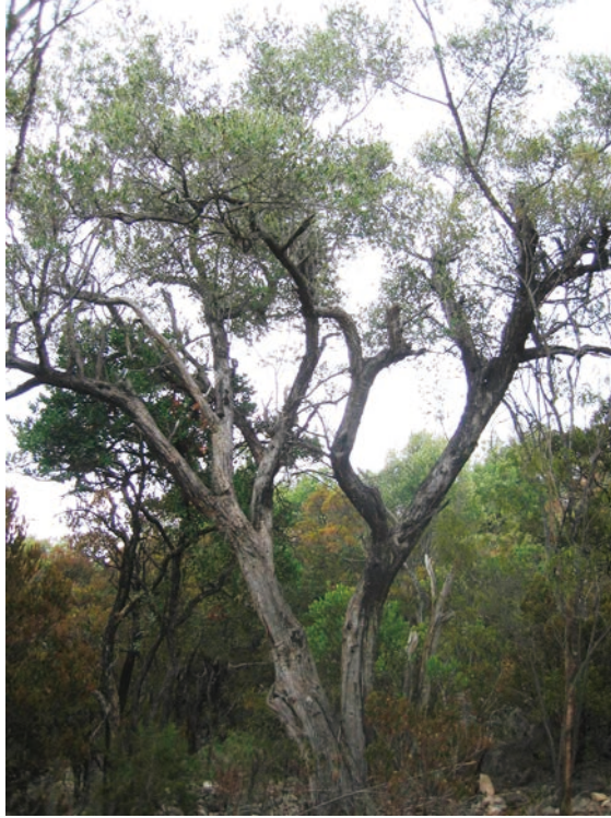
Fig. 5. The wagar tree

cultural heritage which is a moral compass. These are important to us for survival beyond breathing. The right to live in dignity is also having, not just food, but also having your cultural values acknowledged and protected.