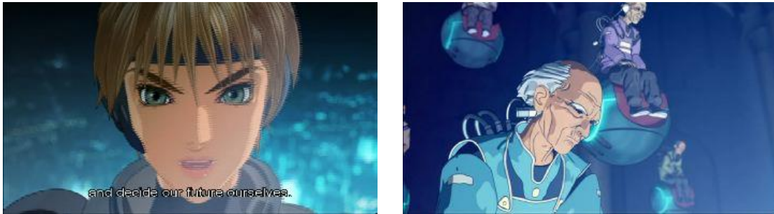
Figure 27 Deunan rejects posthuman essentialism, Deunan (left), The Elders (right). Screen capture from Appleseed .

await us, but we will struggle onward and decide our future by ourselves” (01:30:36-01:30:43). By zooming into a close-up shot of Deunan and the use of dramatic music, this scene is given an emotional tone in its depiction of Deunan’s anger towards the Elders. Again, Deunan expresses her firm determination to reject essentialism – this time, posthuman-essentialism.