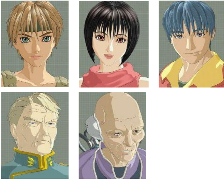
Figure 25 Attractive characters (Deunan, Hitomi and Yoshitsun, top from left to right) and less attractive characters (General Uranus and the Elders, bottom from left to right). Screen capture from Disc 2 bonus track Character Gallery, Appleseed .

In addition to character design, Appleseed depicts humanized bioroids through both narratives and visual images. For example, a conversation scene between Deunan and Hitomi at the bar depicts Hitomi as a normal girl, rather than a different species (00:38:50-00:40:44). Hitomi's voice and gestures are very natural and gentle. Hitomi asks some personal questions to Deunan, about her family and boyfriend over a cocktail. Hitomi expresses her curiosity about love and asks Deunan, "Tell me, what's love like? What's it like to love someone?" Close-ups of Hitomi with zoom-in are followed by Deunan's close-up. Hitomi's behavior is just like that of a human girl, with emotion, and the close-up and zoom-in shots highlight this aspect of her. Hitomi also says "But it [love] somehow intrigues me. It's one thing I envy in humans." Deunan sends Hitomi a half-smile. During their conversation, a man grabs the chest of another man in the bar, shouting "How dare you speak to a human that way!". Hitomi, watching the scene, says to Deunan, "A Regular Army officer. Why do humans anger so easily?" This short scene also contrasts a humanized bioroid (Hitomi) with a savage human (a Regular Army officer).