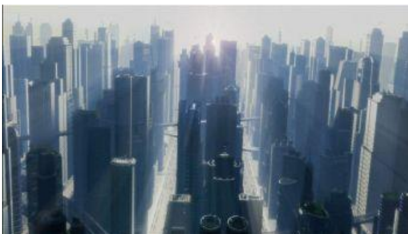
Figure 28 Remained skyscrapers in Olympus: the struggle, the new race and hybridity. Screen capture from Appleseed .

camera movements, the images gradually shift from the ruins to the remaining skyscrapers in Olympus covered in a ray of sunshine. This visual and acoustic choice leads the audience to focus on Deunan's voiceover narration. I interpret Deunan's mention of "the true new race" as a new situation and a hybrid between human and posthuman. Hybridity means the intermingling of different species to produce new species. Here, an idea of hybridity is useful for thinking about alternative views that go beyond the anthropocentrism and the essentialistic idea of human beings, because the idea of hybridity is closely related to the question of whether human beings are a single species or not, which is central to our discussion on species-relativism. I argue that hybridity precisely points out the limits of relativism and essentialism centering on both anthropocentrism in Appleseed and species-relativism in Ager's philosophical argument, and provides an alternative political strategy that goes beyond such arguments.