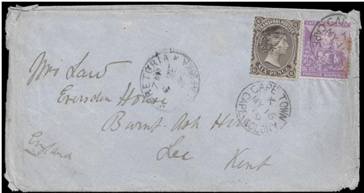
"TRANSVAAL 1879 COMBINATION FRANKING FROM RUSTENBURG"