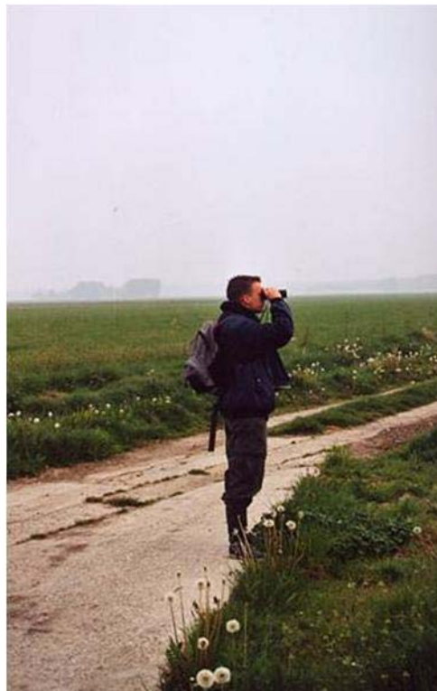
The author carrying out a breeding bird survey

Published in Agriculture, Ecosystems and Environment 126: 270-274