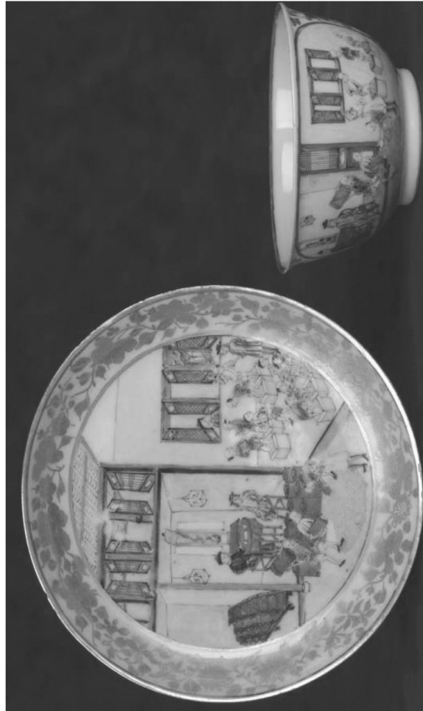
Saucer and teacup, Chine de Commande, diameter of rim 12.8 cm, Qianlong period, c. 1750; decorated with overglaze enamels and gold, showing Dutch and Chinese merchant in Canton overseeing the packing of tea at a warehouse. Source: Courtesy of Prinsessehof Leeuwarden/Nationaal Keramiekmuseum, inventory number: BP 79.