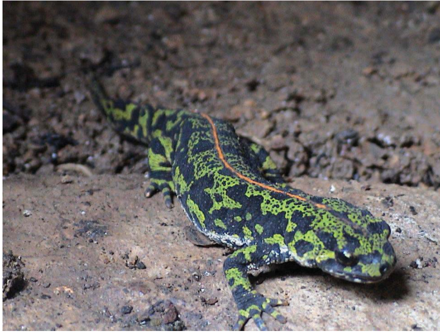
Figure 8 Triturus marmoratus from Dordogne, France.