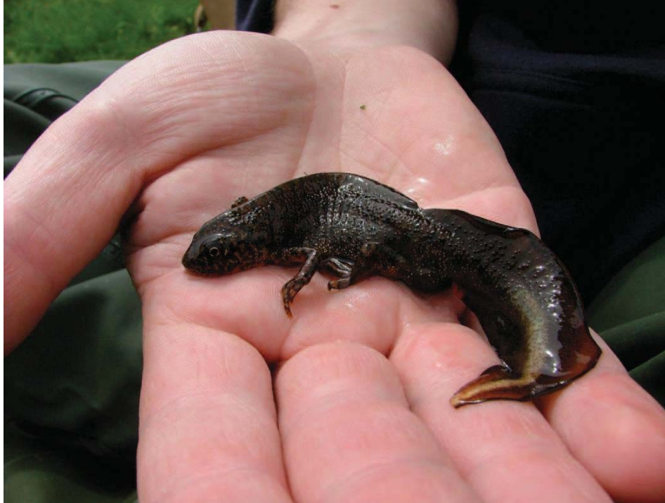
Figure 5 - Male Triturus karelinii from Bozdag, Turkey. The dorsal crest, typical during the breeding season, is folded to the right, and so is not clearly visible.