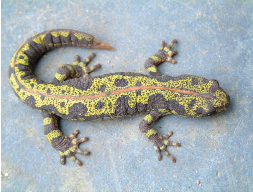
Figure 9 Female Triturus marmoratus from Porto, Portugal. Notice the orange dorsal strip, warty skin, and tissue regeneration in the tailtip, a few weeks after the tailtip was cut for sampling.

Louisiana crayfish ( Procambarus clarkii ) and the sunfish ( Lepomis gibbosus ). These combined factors are causing the disappearance of several populations in southern Spain, contributing to the fragmentation of its distribution (García-París et al., 2001). The situation in T. marmoratus is more stable than in T. pygmaeus , despite its regression in the western coast of Portugal, as it was replaced by T. m. pygmaeus (CHAPTER 9).