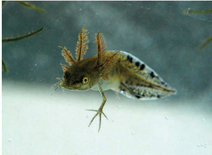
Figure 4 Larva of Triturus cristatus . Notice the dark spots on the dorsal tail fin and the thin long fingers, characteristic of larval stages of Triturus .