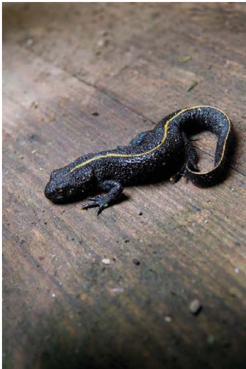
Figure 3 Triturus carnifex female.

The Italian crested newt, Triturus carnifex (Laurenti, 1768), is present south of the Alps and occupies Italy, Slovenia, Croatia, and Austria. It has been introduced in several places, like the Azores in Portugal (where it is the only newt present; MALKMUS, 1995), Geneva in the French-Swiss border (ARNTZEN, 2001), Birmingham and Surry in England (BEEBEE and GRIFFITHS, 2000), Veluwe in The Netherlands (BOGAERTS, 2002), and Bavaria, Germany (FRANZEN et al. , 2002). The Macedonian crested newt, Triturus macedonicus (Karaman, 1922) was until recently considered a subspecies of T. carnifex , but as a result of this thesis, this taxon has been raised to species level (see CHAPTER 2). It occurs in Macedonia, Greece, Serbia, Montenegro, Albania and southern Bosnia and Herzegovina.