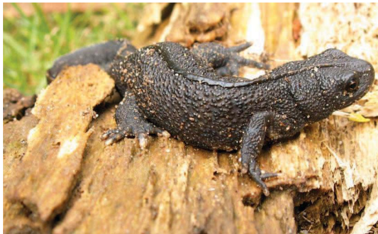
Figure 2 - Triturus carnifex from an introduced population in the region Veluwe, The Netherlands.

Morphologically the species are very similar. They are all large newts with heavily build, and warty skin. Their dorsal side is usually dark brown to black, while their sides are sometimes punctuated with small white spots. Males present a serrated