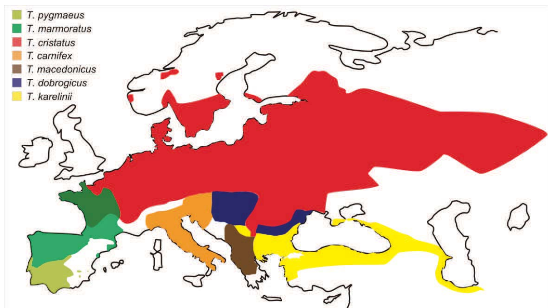
Figure 1 - Distribution of Triturus newts in Eurasia. Notice the area of overlap between the marbled newt ( Triturus marmoratus ) and the great crested newt ( T. cristatus ), in France.

The distribution of the Triturus species is essentially parapatric, their ranges only slightly overlap (Figure 1). This pattern repeats itself in every area where two or more members of this genus meet (ARNTZEN and WALLIS, 1991; see also CHAPTERS 2, 8 and 9). The largest area of overlap is between the great crested newt ( T. cristatus ) and