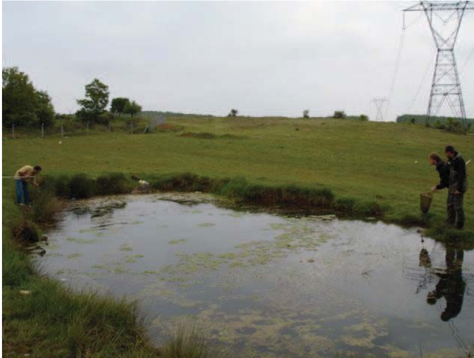
Figure 6 Typical breeding site for newts in Turkey. Nets seen in the left and right are used to capture larvae and breeding adults.