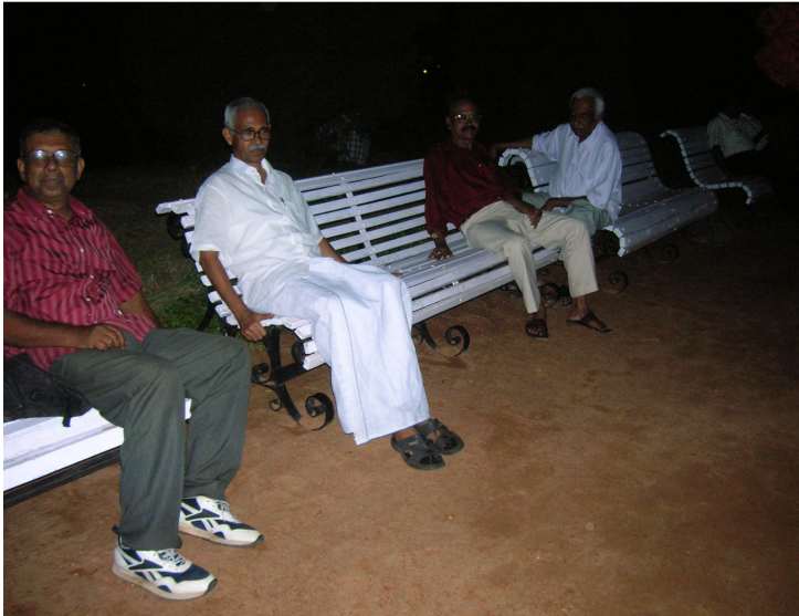
Figure: Men sitting and talking in the central park of the city around dusk. The man in the front is wearing exercise shoes for his walk, the others have just come to chat and stroll.

Molly auntie was 89 when we first met and turned 90 while I was still in Kerala. The second time we met she had reached the age of 91. At that time she still used the same method to water the plants and get exercises in the morning. Apart from watering plants Molly auntie also walked in the neighbourhood streets with two friends. Every evening at around 6 pm one of the other ladies came to collect her and together they walked for about an hour. They used the hour to talk and share thoughts. Their pace was low and they would constantly