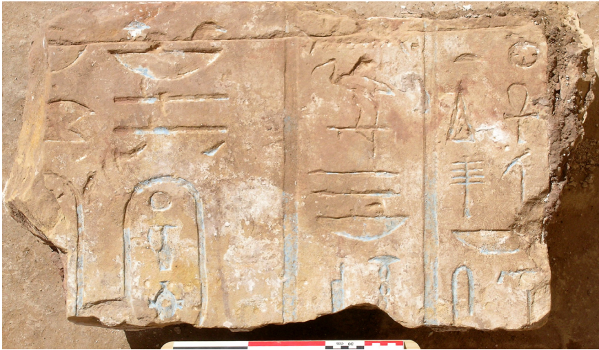
Sandstone block with the cartouche of Amasis and the name of the god Thoth