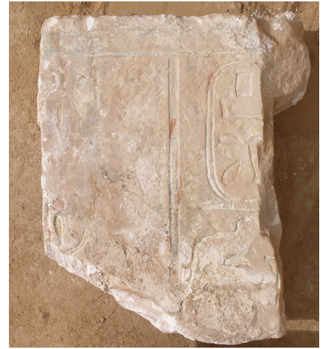
Sandstone block with the cartouche of Pedubast

name ( serekh ) of Nekau has been found, and it is as yet unclear which part of the temple's decoration may be attributed to his reign. Psamtek II is attested upon several blocks found at Amheida. One of these had already been in the time of Amasis, so that it seems that this phase of the building remained standing for many years.