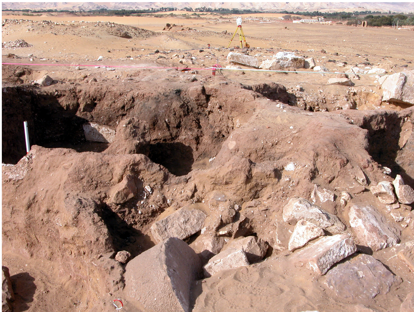
View of the temple area with pits from earlier illicit excavations and scattered blocks

Another layer of history was added as soon as it was realised that many relief blocks were decorated on more than one side. The Roman Period temple to Thoth had been constructed out of building blocks from an earlier temple of the Twenty-sixth Dynasty. Three kings of that dynasty are named on the blocks, namely Nekau II (610-595 BC), Psamtek II (595-589 BC) and Amasis/Ahmoses II (569-526 BC). The cartouche of Amasis in particular occurs in many of these reliefs. The reuse of these blocks in the Roman Period is apparent from the remains of gypsum mortar on the faces of all earlier reliefs. Nekau II is virtually unknown as a temple builder, so it is exciting to find his name here. So far, only a fragmentary Horus