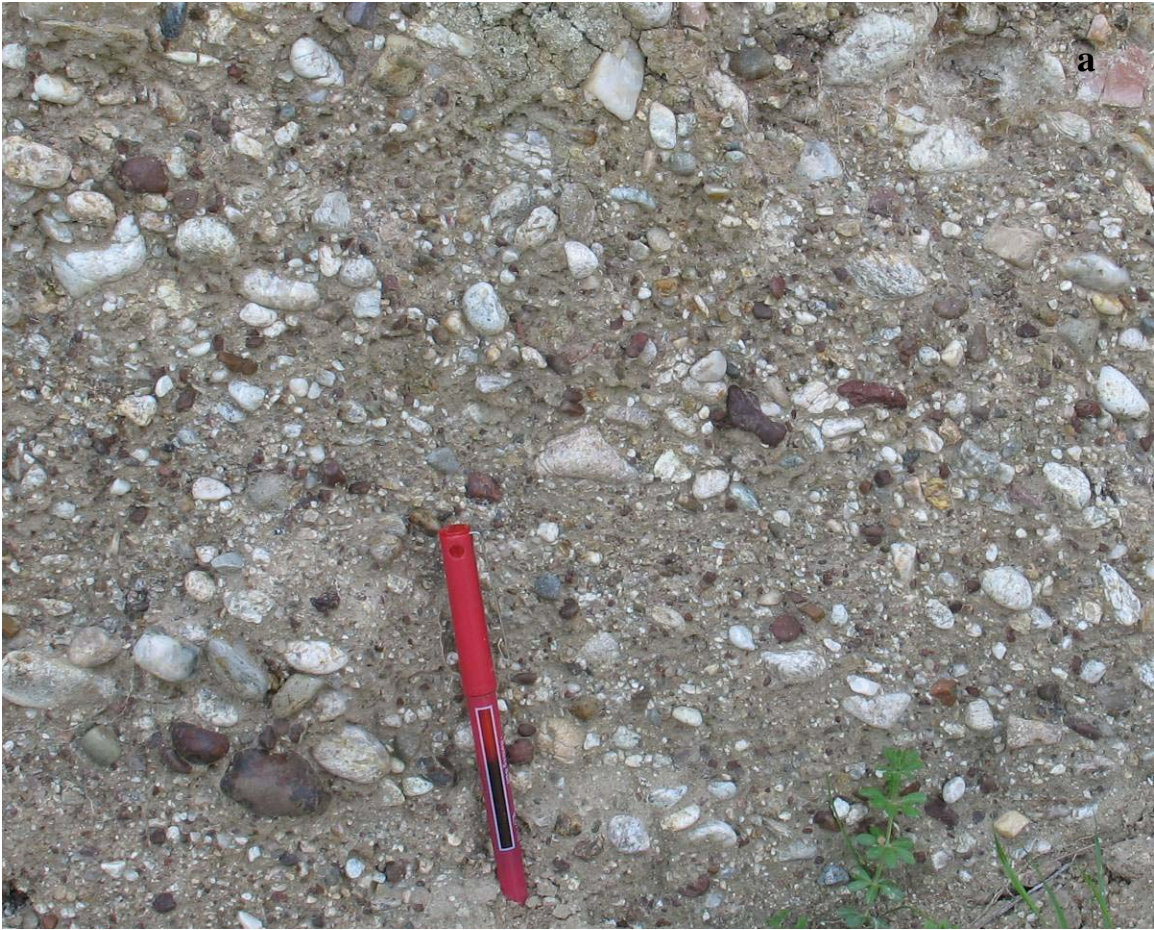
Fig. 15 Detail of fluvial gravels at a) FS 30 b) Kastri Quarry.