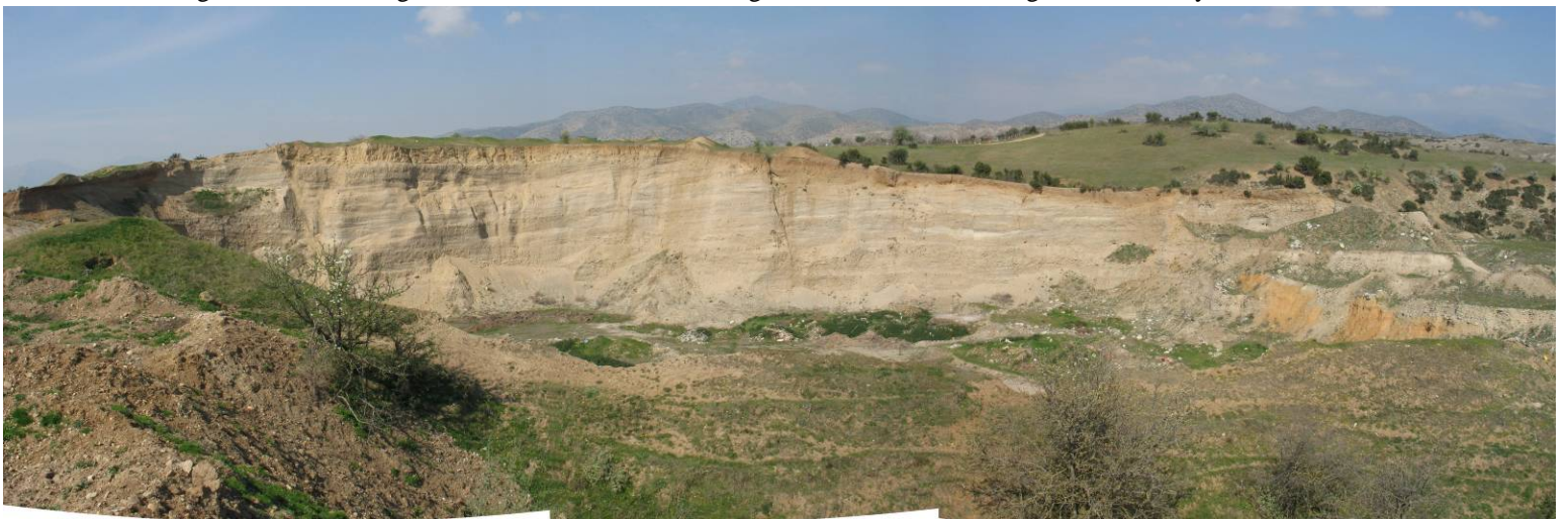
Fig. 13 View to the north, looking at the northern section at Kastri Quarry, where the Neogene/Hochterrasse contact is exposed. Two of the exposed faults are also visible.