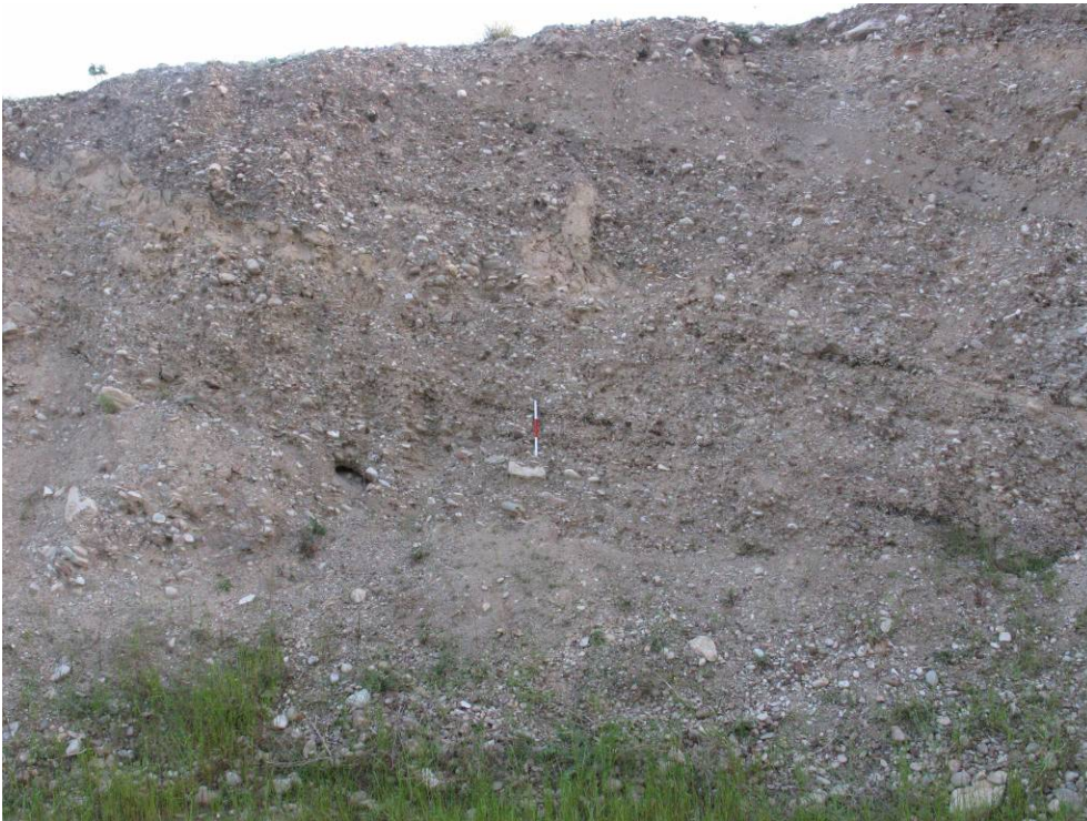
Fig. 17 'Hochterrasse' gravels (i.e. fluvial deposits pre-dating those of the Niederterrasse) exposed at section C, overlying the Neogene deposits. Note the tilting of the sediments due to down-faulting.