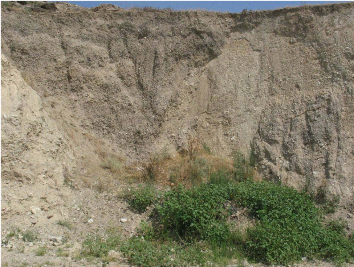
Fig. 16 Fault exposed at section C at Rodia. Fault mirror and slickensides are visible.