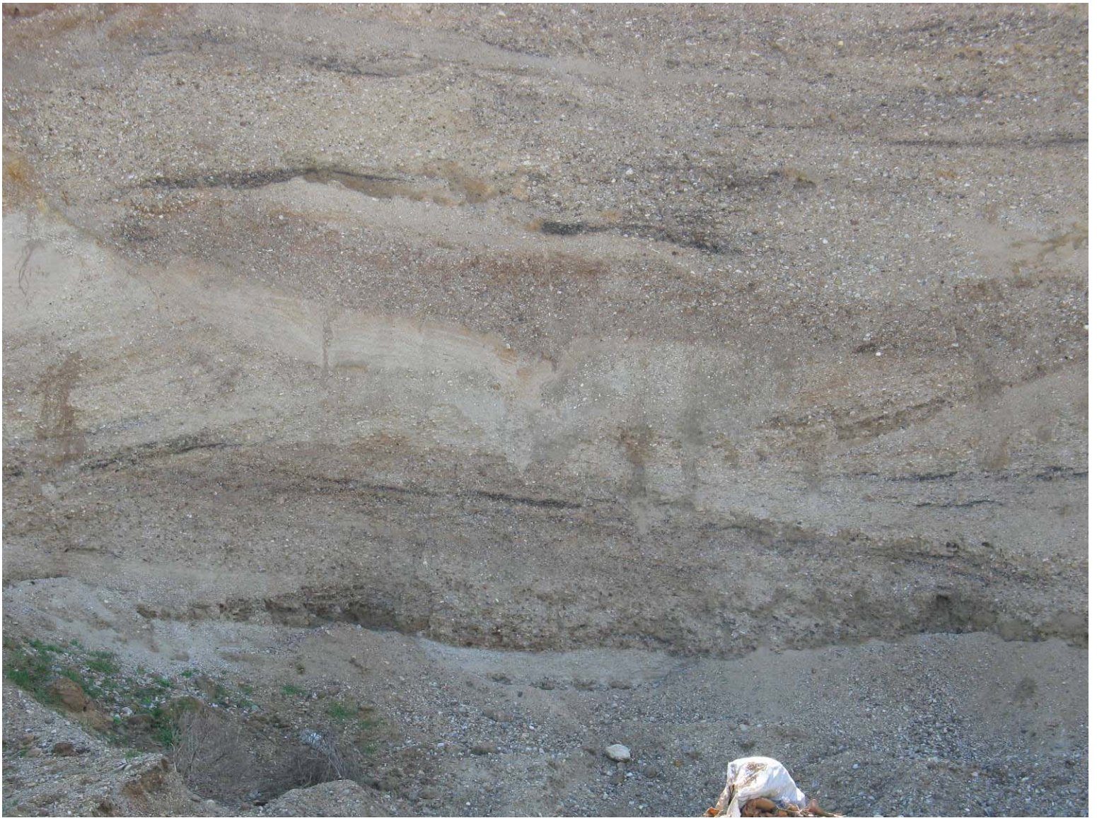
Fig. 12 Part of the southern section exposed at Kastri Quarry. Note the cross-bedding and how coarse-grained sands and gravels alternate with more fine-grained material, including loams and clays.