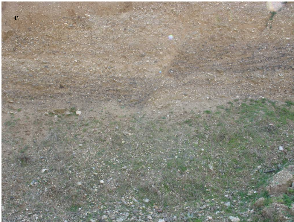
Fig. 14 Faults exposed at the northern section of Kastri Quarry. a) exposed fault mirror b) fault parallel to that of a) c) fault antithetic to that of b)