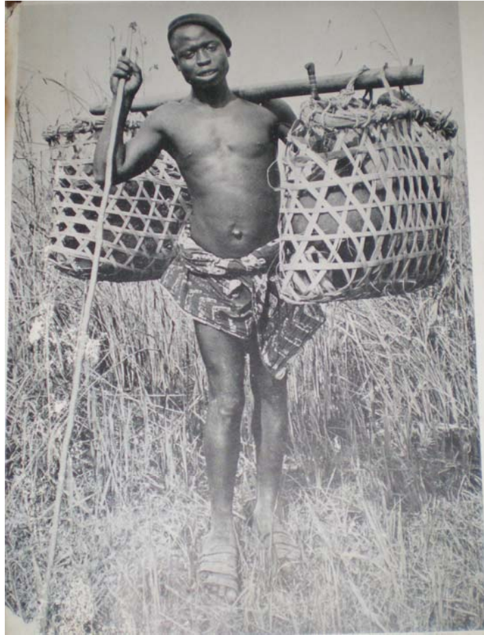
Photo 3.1 A Kom carrier with his luggage en route to Northern Nigeria in 1940