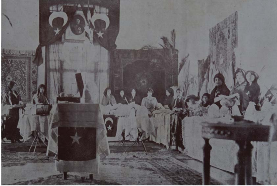
Figure 3 “From the changes and evolutions of the world of Muslim women: a view of the “Charity Fair” organized in Şişli with the assistance of the respected Ottoman ladies by the esteemed wife of His Excellency the Minister of Navy, Cemal Pasha.” Servet-i Fünun , 1196, 24 Nisan 1330 (7 May 1914), front page.

A look at the list of names of women involved in the sales of goods, flowers and refreshments confirms that the Osmanlı Kadınlar Cemiyet-i Hayriyesi was a real Ottoman organization which had representatives of several of the ethno-religious groups living in the Ottoman Empire amongst its membership. It seems that even some women of non-Ottoman citizenship participated in its activities. This might be one of the reasons that Osmanischer Lloyd/Lloyd Ottoman paid so much interest in the activities of this particular organization. 129 The fair was very successful. The interest shown was so large that the gender segregation which had been planned through the opening of the fair to men and women on different days could not be maintained: women could not be prevented from coming on a day which was initially scheduled for men. Amongst the many visitors were not only high-ranking Ottoman officials and