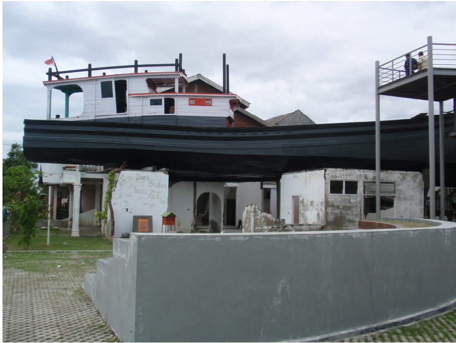
Picture 5 Ship on a rooftop in Lampulo, Banda Aceh, June 2010