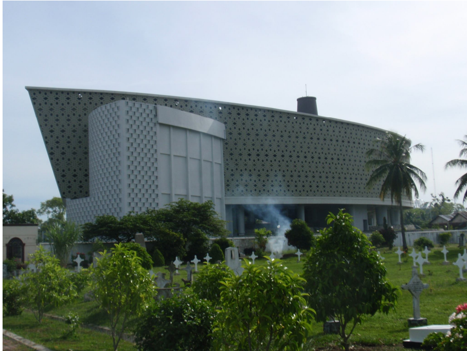
Picture 7 The Tsunami Museum, view from the colonial Dutch cemetery ( Kerkhoff ), Banda Aceh, May 2010