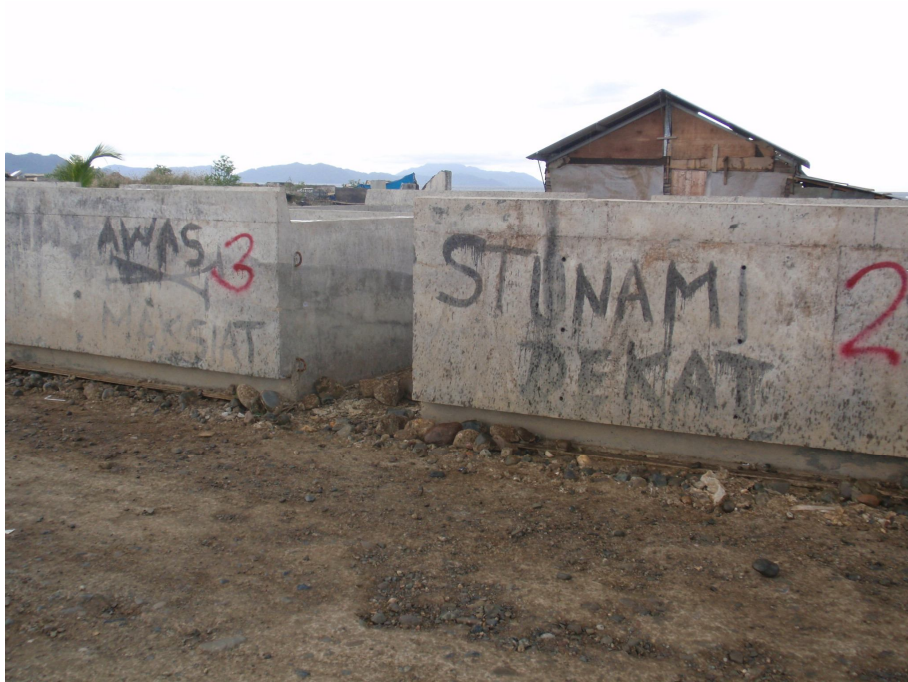
Picture 11, 'Beware of sins, the tsunami is near', Uleelheue, Banda Aceh, April 2009