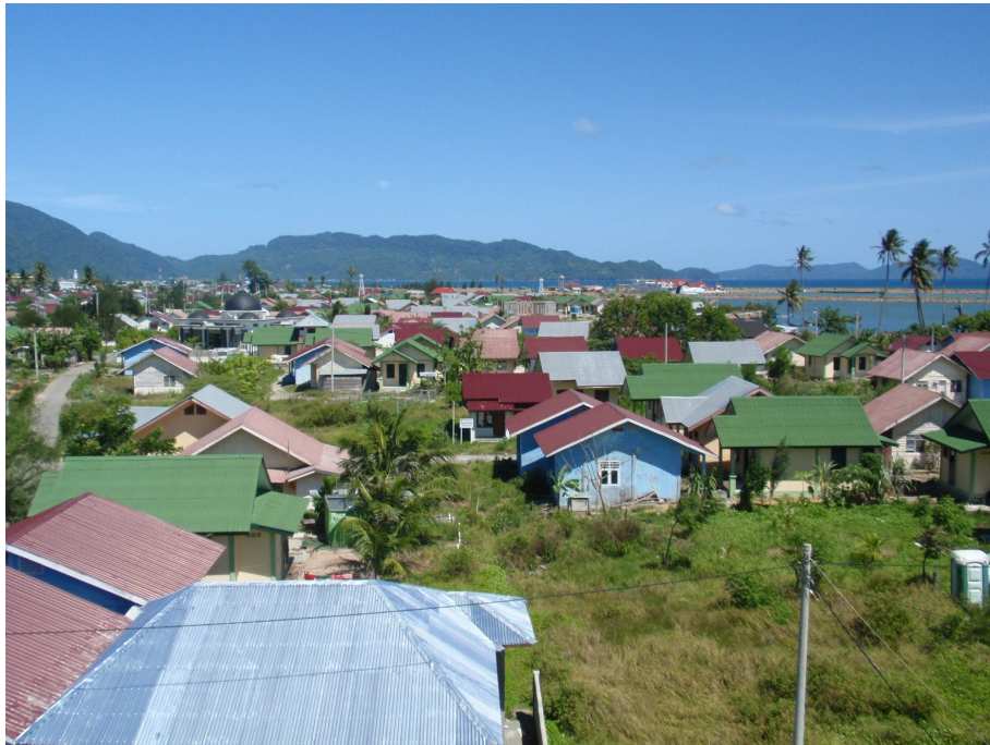
Picture 1 Tsunami aid houses in Banda Aceh, June 2009