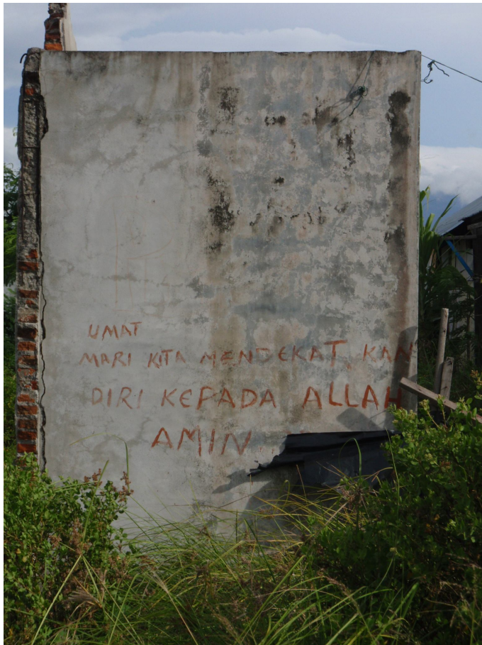
Picture 10 Wall inscription in Lamdingin , Banda Aceh, May 2009