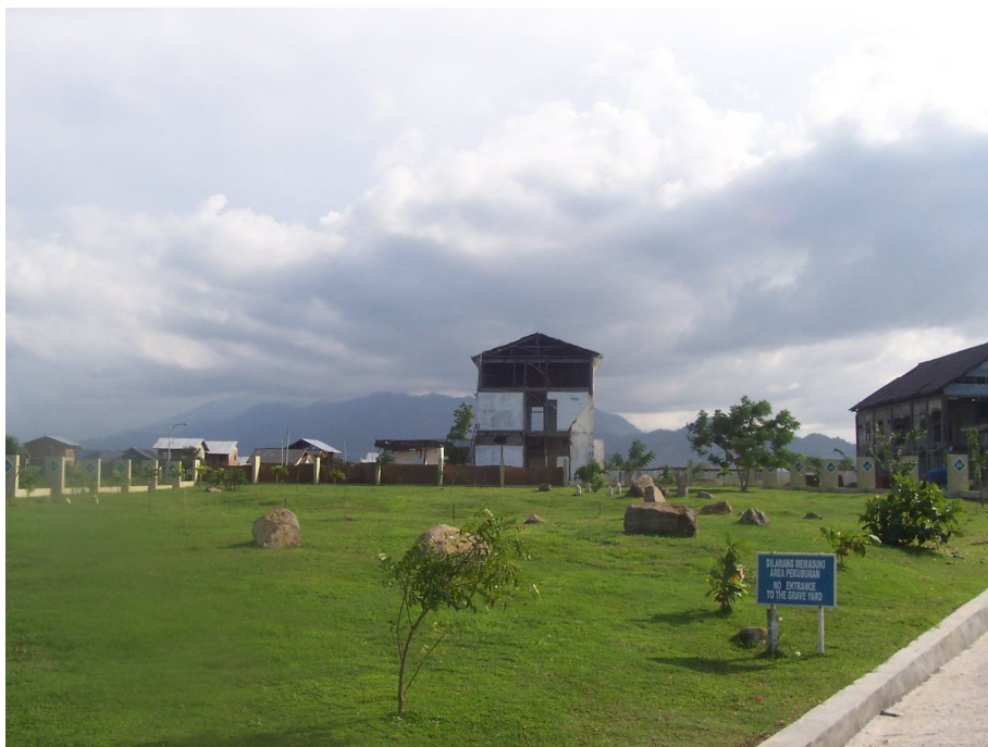
Picture 6 Mass grave in Uleelheue, Banda Aceh, December 2007