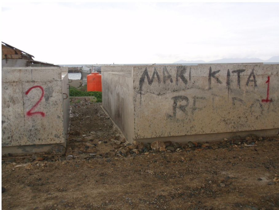
Picture 12, 'Let us pray', Uleelheue, Banda Aceh, April 2009