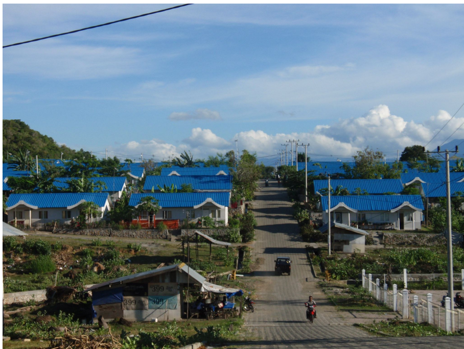
Picture 2 Tsunami aid houses in the relocation neighborhood in Neuheun , Aceh Besar, May 2009