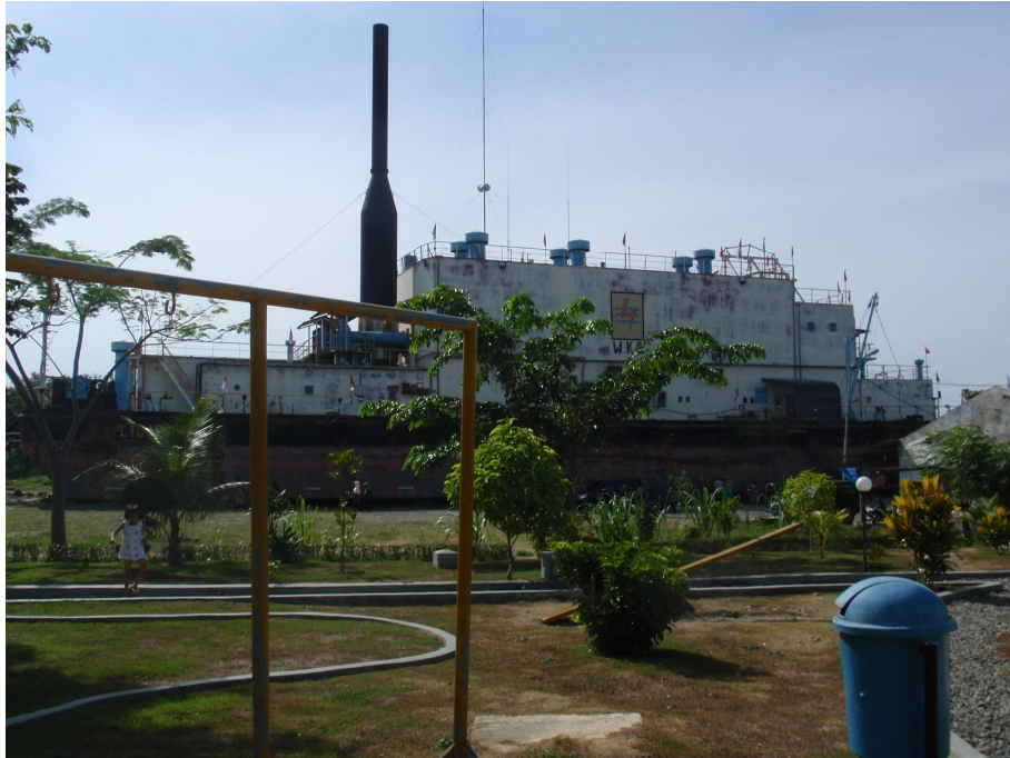
Picture 3 The PLTD Apung ship, view from the Tsunami Education Park, Banda Aceh, May 2010