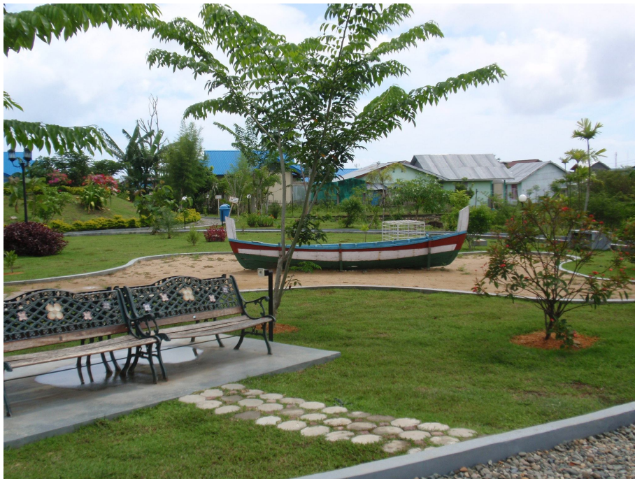
Picture 4 The Tsunami Education Park, Banda Aceh, May 2009