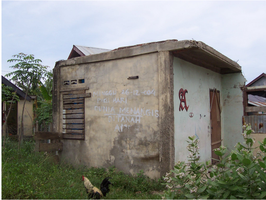
Picture 9 Wall inscription in Kampong Jawa , Banda Aceh, March 2008