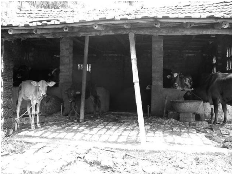
Cattle in Kashimpur