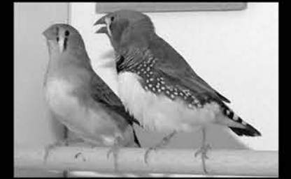
Typical male courtship display in the zebra finch Taeniopygia guttata (female is on the left)