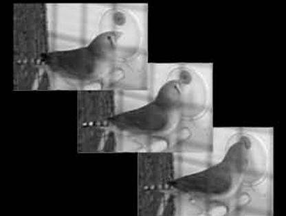
A zebra finch female pecking a key to broadcast a male song in an operant test