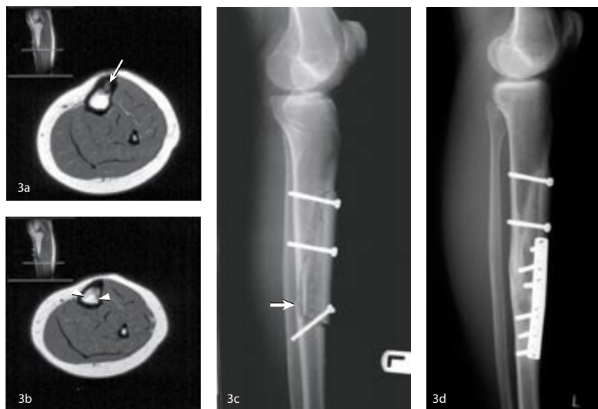
Figures 3a-d. Case 13. A 17-year-old girl with an adamantinoma involving 80% of the circumferential cortex. Figure 3a – Preoperative axial T1 – weighted MR image of the tibia showing the tumour arising from the anterior cortex (arrow) with intermediate signal intensity in the centre and low signal intensity from the surrounding sclerotic border. Figure 3b – MR scan distal to the centre of the tumour, showing extensive horse-shoe-shaped medullary involvement (arrowheads) extending close to the dorsal cortex of the tibia. Resection of more than 80% of the circumferential cortex was needed to obtain wide margins. Figure 3c – Postoperative radiograph showing reconstruction with a fitted inlay allograft and fixation by a lag screw. Distally, where less than 20% of the cortical circumference remained, a fracture occurred (arrow). Figure 3d – Radiograph at 51 months after plate fixation of the distal fracture showing incorporation of the allograft beneath the plate. There is hypertrophy of the remaining hemicortex at the site of the fracture.

tudinal osteotomies. Plain radiographs of the primary site and of the chest were taken every three to four months for the first two years and at least yearly thereafter to evaluate potential recurrence and distant metastases.