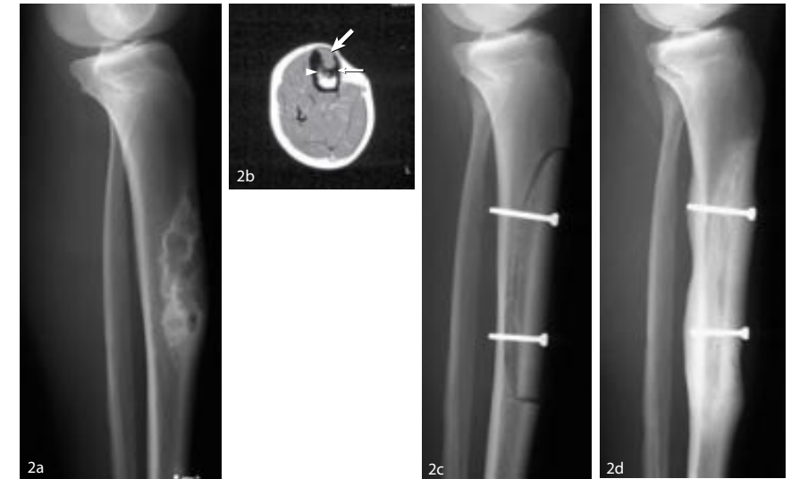
Figures 2a-d. Case 5. A 17-year-old girl with an adamantinoma of the tibia. Figure 2a – Preoperative lateral radiograph. Figure 2b – Preoperative axial T1-weighted MR scan showing intermediate signal intensity from the centre of the tumour (large arrow), low signal intensity from the sclerotic ridge (small arrow) and medullary involvement (arrowhead). Figure 2c – Postoperative radiograph showing reconstruction with a fitted inlay allograft and fixation with screws. Figure 2d – radiograph at 84 months showing incorporation and hypertrophy of the remaining hemicortex.

The defects were reconstructed using fresh, deep-frozen inlay allografts. They were retrieved and preserved according to the guidelines of the American Association of Tissue Banks and the European Association of