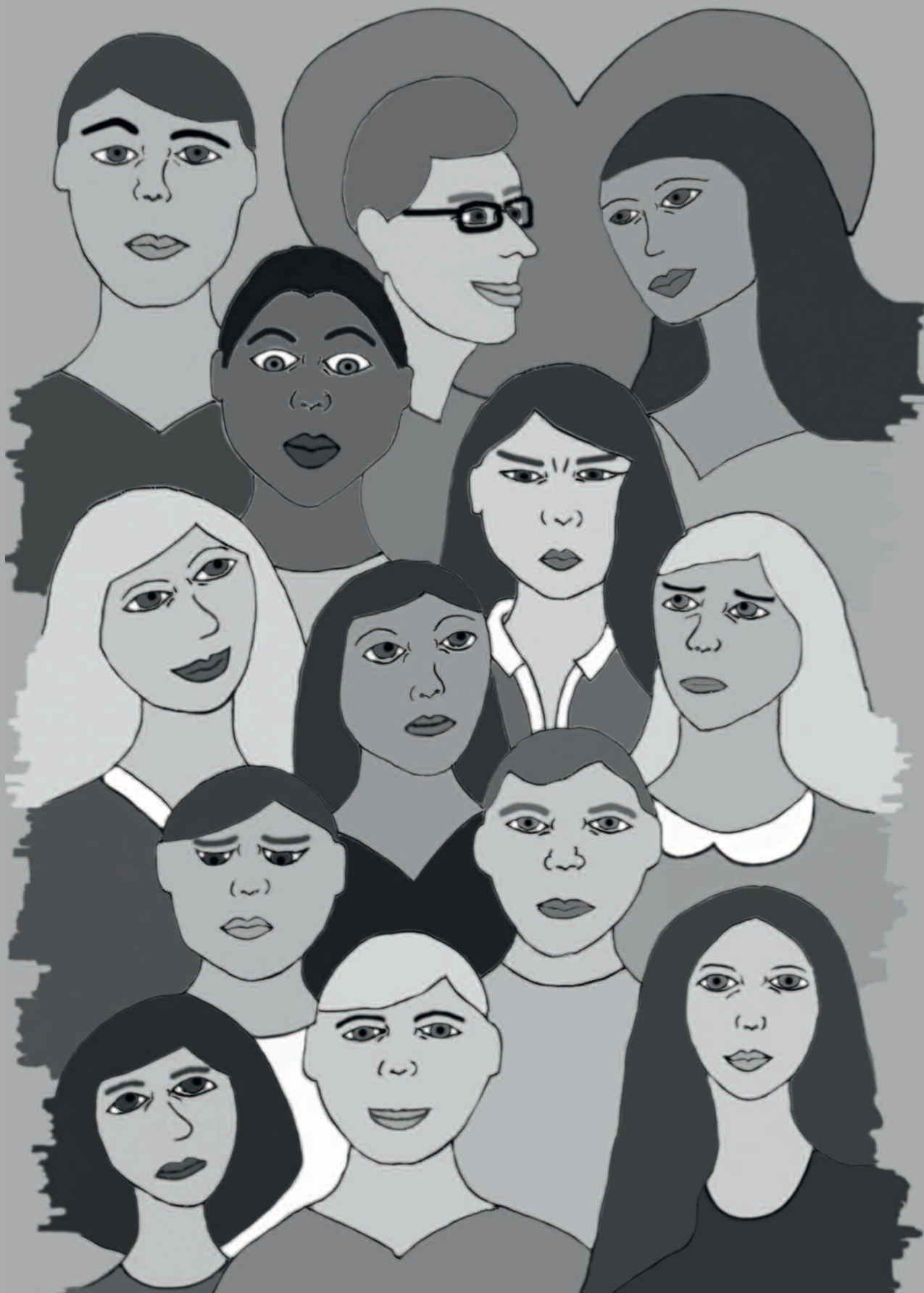
Social reorientation in adolescence