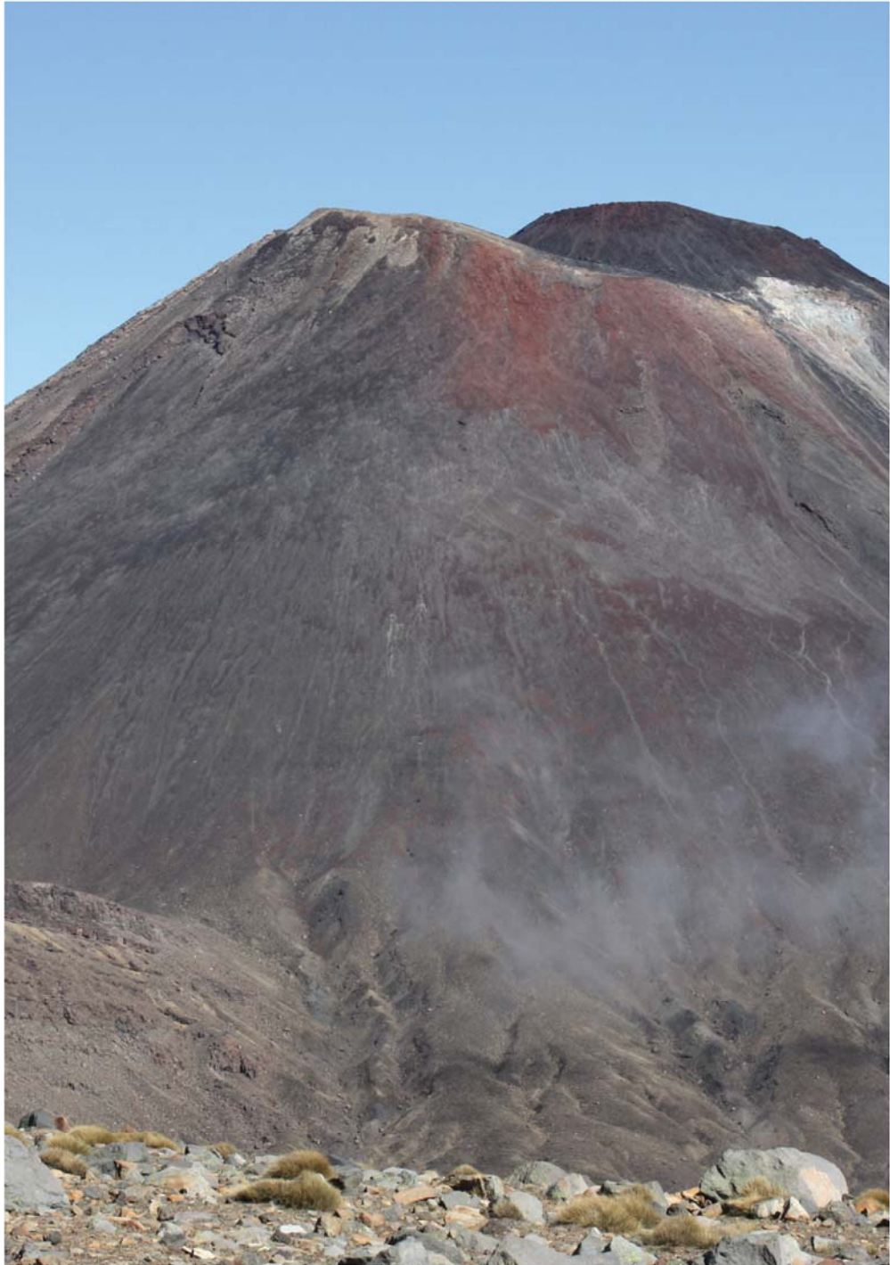
Mount Ngauruhoe, New Zealand