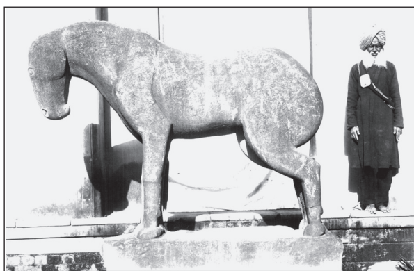
FIG. 15. Stone horse, Khairigarh (UP). State Ms Lucknow, H.219