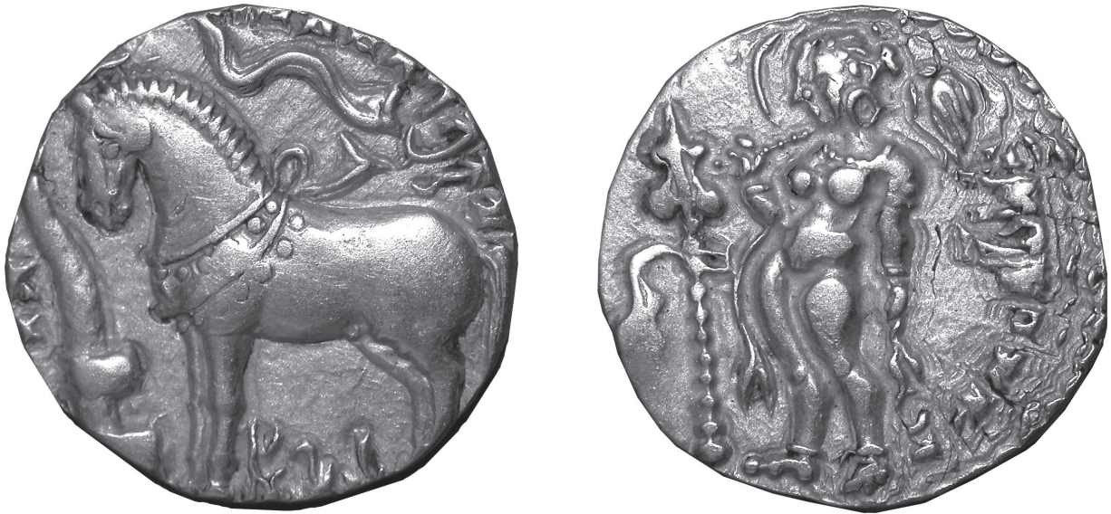
FIG. 16. Gold coin, Aśvamedha T., Kumāragupta I. W: 8.10 g, D: 2.00 cm. Dhananjaya coll. DIN7208