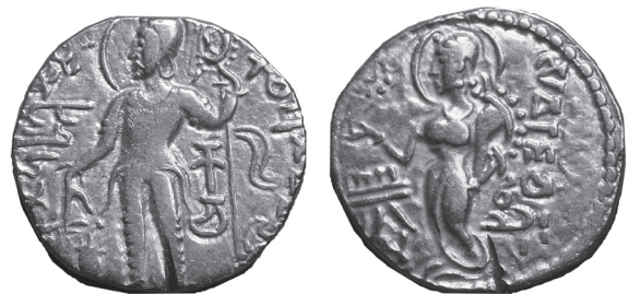
FIG. 7. Gold coin, Kāca T, Gr. 3. W: 7.32 g, D: 1.90 cm. Pankaj Tandon coll., 344,28. DIN2740