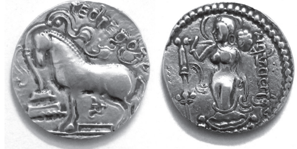
FIG. 21. Gold coin, Aśvamedha T., Gr. 4, Var. 1.2, with a step beneath the horse. W: 7.569 g, D: 2.20 cm. Government Ms Mathura, 21. DIN829