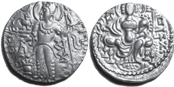
FIG. 4. Gold coin, Sceptre T, Gr. 3. W: 7.80 g, D: no data. Government Ms Mathura, 1246. DIN8015