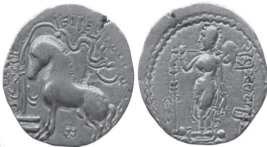
FIG. 24. Gold coin, Aśvamedha T., Gr. 3, Var. 3.1. W: 7.51 g, D: 2.30 cm. Shivlee coll., 1040. DIN888