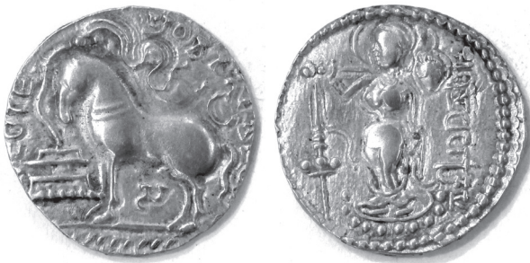
FIG. 22. Gold coin, Aśvamedha T., Gr. 4, Var. 1.3. W: 7.611 g, D: 2.20 cm. State Ms Lucknow, 10923. DIN7981