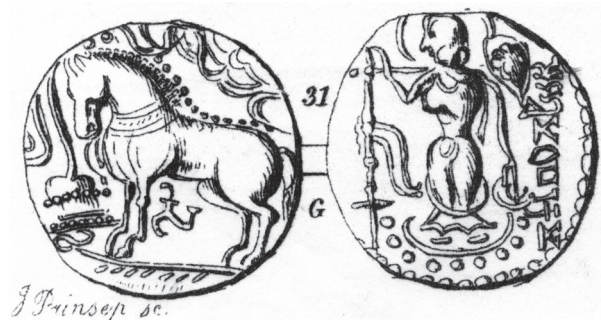
FIG. 18. Probably the first Aśvamedha coin published. Drawing by James Prinsep (1835)

It was the next specialist for Gupta coins, Edward Thomas, who linked the Aśvamedha coins to Samudragupta and placed the horse back to the obverse (1855: 498), next to 'an Altar'. 41 Among the small number of gold coins discussed and illustrated in his 1876 Records of the Gupta Dynasty , Thomas included an Aśvamedha coin of the British Museum. He suggested that the female figure could perhaps be Pārvatī (p. 22, fig. 7.4). Apparently in these decades there was a tendency to identify female figures on the reverse of Gupta gold coins with this goddess. In his influential cataloguing articles and book,