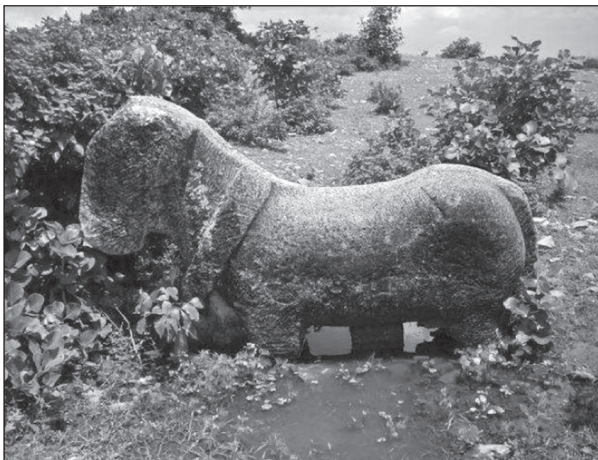
FIG. 17. Rock-cut horse, Nagauri (MP). Length 2.5 m