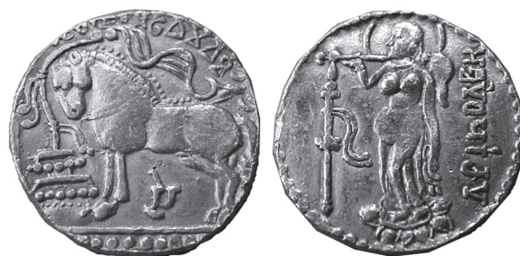
FIG. 10. Gold coin, Aśvamedha T. Controversial strike. W: 7.98 g, D: no data. In trade before 2010. DIN7187

study of the Aśvamedha coins (§4), a detailed description of the devices on obverse and reverse (§§6–7), examining the Sanskrit legends (§8) and engaging in some hard-core mint idiomatic analysis (§9). The paper then moves on to a case study (§10) of three near-identical Aśvamedha coins on which there was considerable controversy (Fig. 10). 9 I shall show how these