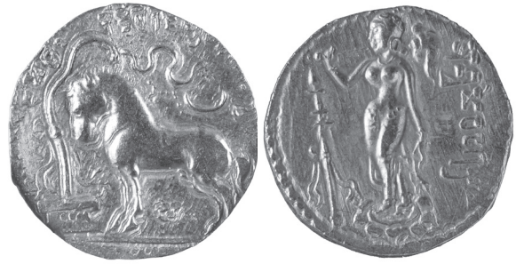
FIG. 11. Aśvamedha T, Gr. 3, Var. 3.3. W: no data, D: 2.22 cm. LACMA, M.84.110.1. DIN858

The close parallelism between the qualities expected in Śrī's ideal partner and those of Samudragupta as praised in the Allahabad praśasti is obvious. Or, as Daud Ali wrote: 'by the Gupta period the very nature of nobility was considered to be a judicious mix of the values