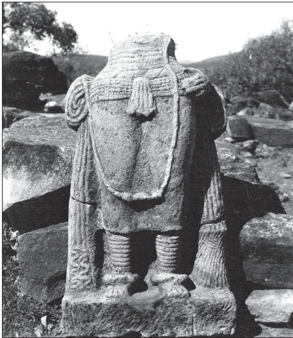
FIG. 30. Nāginī wearing a beaded mālā . Stone, Nagauri, c. first century CE.

Beaded mālās such as these may have been part of royal adornment, and we find them particularly worn by mythic Serpent kings and queens in the area of Sanchi. A monumental nāgarāja at Nagauri, datable to about the first century CE, wears a single-string cord with beads (Shaw 2007: fig. 139). The matching in situ nāginī (Fig. 30), probably the one now reported stolen from the site (Shaw 2007: 94), offers us