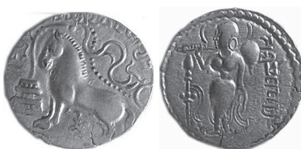
FIG. 2: Gold coin, Aśvamedha T., Gr. 3, Var. 1.2. W: no data, D: no data. Todywalla, auction 11 (2005), lot 73. DIN4529