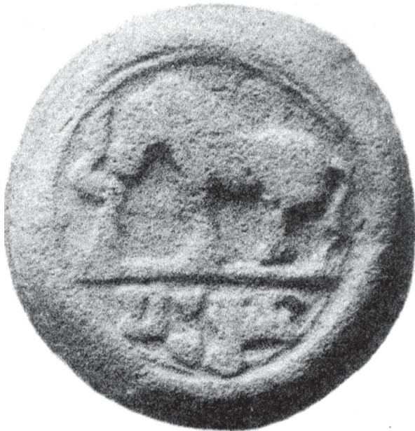
FIG. 14. Sealing depicting a horse and a yūpa . Legend: para(ā)krama . In 1901 in the L. White King collection. D: 2.3 cm. After Rapson 1901: fig. 3

More 'pious' than low-cost was the gift of a c. 1.5 m tall, stone horse 'dug up near the ancient fort of Khairīgarh' (Smith 1893: 98), in