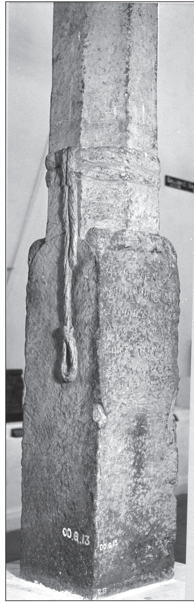
FIG. 13. Stone yūpa from Isapur. Government Ms Mathura, Q.13.

In early historic India the custom arose to apply the term yūpa also to a column serving as a more durable memorial of a Vedic sacrifice, whether Aśvamedha or otherwise. 26 An inscription on such a memorial column from Isapur, near Mathura (UP), dates back to the Kuṣāṇa period. It states that the yūpa was erected after the completion of a sacrifice lasting 12 nights (and days— dvādaśarātra ). Such stone memorial pillars could evoke the shape of an actual, wooden yūpa through a curved top with a ring shoved over it. 27 The stone yūpas from Isapur show this detail (Vogel 1914). They even reproduce the rope tied on the sacrificial stake (Fig. 13) prescribed by the texts. The shafts are octagonal and bent at the top. They reproduce the top-ring ( caṣāla ), while the gird-rope ( raśanā ) of Kuśa grass is also carved on both pillars. On one pillar it is wound three times around the shaft, as the ritual prescribes. A garland is shown hanging down from the top of the pillar. 28 The Isapur yūpas are exceptional in the extent to which they reproduce their wooden counterparts. Neither the yūpas erected by Maitraka royals at Badva (in Rajasthan) 29 nor the yūpa now in the fort at Bijayagarh (see below) are girded by ropes. Some stone yūpas were given an octagonal shaft as ritually required for the sacrificial stake, but others are round. All these memorial yūpas have a squared basis, which fits