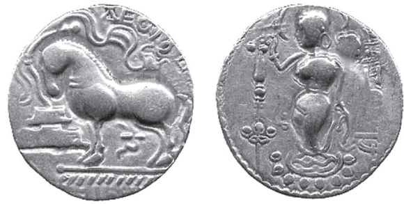
FIG. 23. Gold coin, Aśvamedha T., Gr. 4, Var. 1.4. W: 7.54 g, D: no data. Baldwin's, auction 40 (3 May 2005), lot 654. DIN455