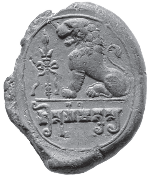
FIG. 14a. Terracotta sealing of Āryamitra. Gupta period. Legend: śrī-āryamitrasya . British Ms, 1892,1103.93. Width 4.45 cm, H: 5.2 cm, Depth: 1.1 cm