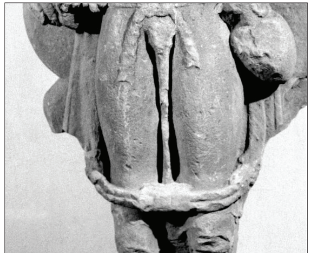
FIG. 31. Detail of a clasp on a mālā worn by a nāgarāja , Firozpur, c. fifth century CE