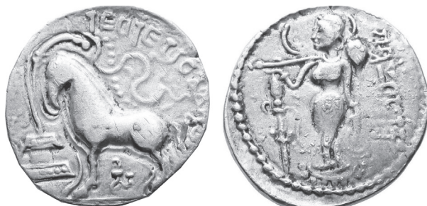
FIG. 1: Gold coin, Aśvamedha T., Gr. 3, Var. 1.1. W: 7.29 g, D: 2.15 cm. Ashmolean Ms, 694 HCR 23085. DIN822

Ajay Mitra Shastri held that the Aśvamedha coins came third in relative quantity, after those of Sceptre and Archer Types (1997: 66), but statistics on documented coins show otherwise (Fig. 3). 3 Not surprisingly, the Sceptre Type (Figs 4 and 5) is the most prolific among coins of Samudragupta, while those of King-and-Queen (ratio 1:4, Fig. 6), Aśvamedha (1:4.5) and Kāca Types (1:5, Fig. 7) make up the mid-segment. Considerably less numerous are the coins of