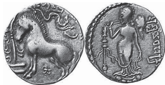
FIG. 25. Gold coin, Aśvamedha T., Gr. 3, Var. 3.2. W: 7.39 g, D: c.2.10 cm. Nupam Mahajan coll. DIN880

ring-shaped band at the top of the memorial yūpas . On the coins the two sides of the caśāla were mostly represented by two dots, the die engravers' usual solution for roundish shapes. A piece of cloth flies from the top of the yūpa like a pennon, probably recalling the fluttering of cloths with which the sacrificial stake is covered.