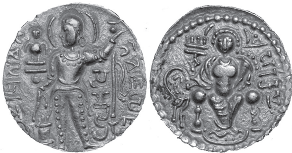
FIG. 5. Gold coin, Sceptre T, Gr. 4. W: 7.38 g, D: 2.11 cm. Deepak Dhaadha coll., G1-Sceptre-DD-157. DIN7452