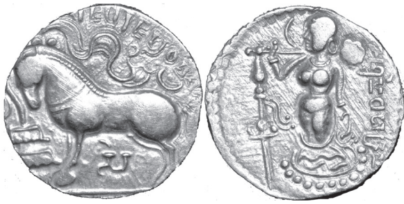
FIG. 20. Gold coin, Aśvamedha T., Gr. 4, Var. 1.1. W: 7.55 g, D: 2.10 cm. Deepak Dhaadha coll., G1-Asva-DD-024. DIN7291