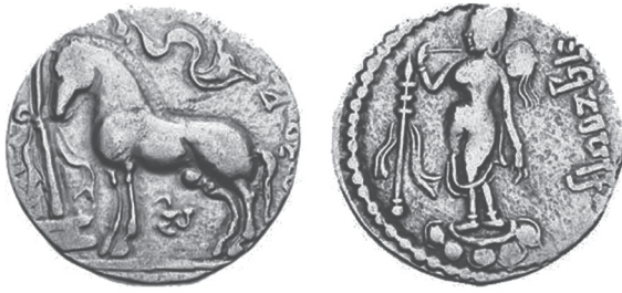
FIG. 26. Gold coin, Aśvamedha T., Gr. 3, Var. 3.4. W: 7.72 g, D: no data. CNG, auction Triton 9 (9 January 2006), lot 1165. DIN1196