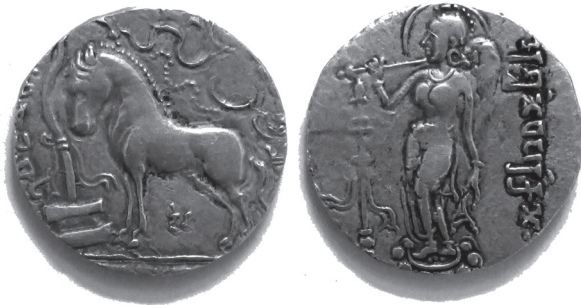
FIG. 28. Gold coin, Aśvamedha T. Gr. 3, Var. 5.1. W: 7.636 g, D: 2.20 cm. Government Ms Mathura, 754. DIN830