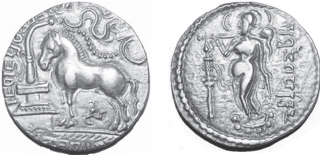
FIG. 19. Gold coin, Aśvamedha T., Gr. 3, Var. 2. W: 7.58 g, D: 2.20 cm. Shivlee coll., 1034. DIN5589

The engravers also reproduce the wooden caśāla , which is prescribed to be 10 aṅgulas 45 long and described as a kind of 'ring narrow in the centre'. It rests over the top of the sacrificial stake and, when rendered in stone, became a kind of