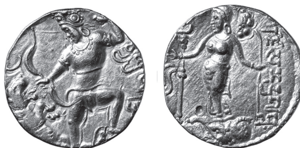
FIG. 9. Gold coin, Tiger-slayer T., Gr. 3. W: 7.57 g, D: 2.00 cm. British Ms, 1853,0301.372, from Emily Eden. DIN1285