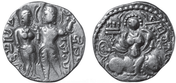
FIG. 6. Gold coin, King-and-Queen T, Gr. 4. W: 7.86 g, D: 2.00 cm. British Ms, 1910,0403.3. DIN568