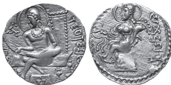
FIG. 8. Gold coin, Lyryst T., Gr. 3. W: 7.57 g, D: unrecorded. Goldberg, auction 42 (23.9.2007), lot 843. DIN300

The present paper does not aim to expand on existing studies of the Vedic Aśvamedha ritual, nor does it zoom in on the historic context of Samudragupta's horse sacrifice. 8 Instead it puts the coins that testify to the event in the centre of attention. This entails a historiography of the