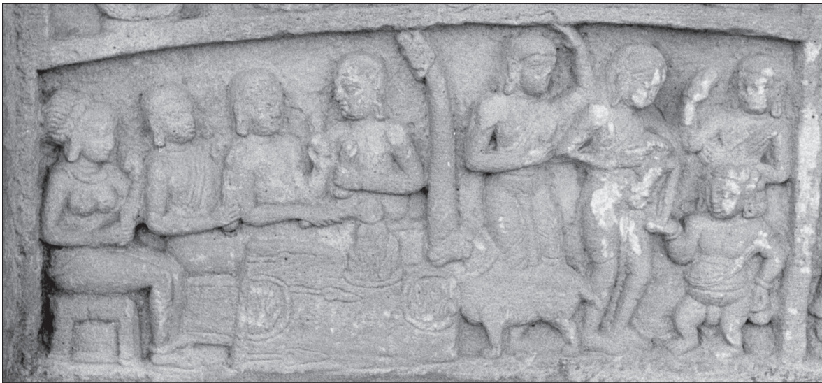
FIG. 12. Sacrifice at a yūpa , torāṇa architrave, Pawaya, fourth century CE

Next to textual descriptions, there are also visuals showing us the performance of a sacrifice involving a yūpa . Here I only mention a well-known architrave from the gateway of a temple complex at Pawaya (MP) dating back to Gupta times. Its relief offers a clear depiction of a yūpa used in the sacrifice of a sheep (Fig. 12). The lord of the sacrifice in this relief is the demon King