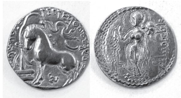
FIG. 29. Gold coin, Aśvamedha T., Gr. 3, Var. 5.2. W: 7.47 g, D: 2.20 cm. State Ms Lucknow, 3977. DIN832

stand (Figs 11, 24–9), such as we frequently encounter in Gupta period art. 46 Altekar assumed that the engravers were moved by artistic considerations when they added a basis to the yūpa , in other words, that they made it up to make the yūpa look more fancy and impressive. We might consider instead that they may have felt inspired by the architecture of pillars or even stone yūpas with an ornamental basis of some kind. The consistency with which the engravers also added a brick-built platform 47 underneath the horse suggests that some effort indeed did go into creating the most suitable environment, either for the event itself, or for the site meant to commemorate it afterwards. 48