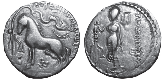
FIG. 27. Gold coin, Aśvamedha T., Gr. 3, Var. 4. With hayamedhaḥ . W: 7.37 g, D: 2.30 cm. Pankaj Tandon coll., 405,60. DIN892