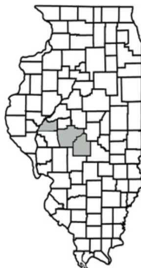
Figure 1. Location of Cass, Sangamon and Christian counties in Illinois, IL, USA.

ArcView GIS 3.2 and ArcGIS Spatial Analyst (Environmental Systems Research Institute, Inc., Redlands, CA, USA) were used to determine field area (ha), field edge length (m), width of FE (m), distance to nearest large non-agricultural area (>1 ha), proportion of non-agricultural area at three different scales, and soil type. Field length was the length of the field adjacent to the FE where traps were placed. Complexity, i.e. , proportion of non-agricultural area to agriculture, was determined using nested circular buffers (with radii of 500 m, 1000 m and 6000 m) around the center of each group of samples per field. We used existing landcover classifications from satellite imagery [30]. We defined agriculture as arable land sown in corn, soybean, winter wheat ( Triticum aestivum ) or other row crops. We defined non-agricultural areas as those classified as upland forest, savannah, coniferous forest, wet meadow, marsh, seasonally flooded, floodplain forest, swamp and shallow water. Other classifications such as clouds and cloud shadows were not included in calculating landscape complexity (Table S3).