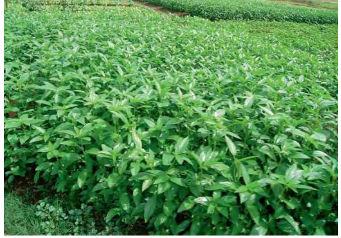
Peri-urban cultivation of jew's mallow, Ivory Coast.