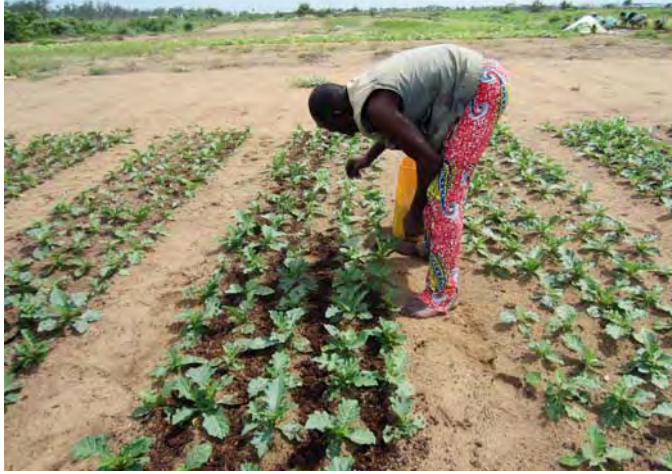
Applying manure on gboma eggplant, Benin.