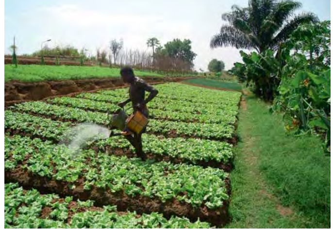
Watering crops, Ivory Coast.

tuce, cucumber, Chinese cabbage, zucchini and French beans. If enough land is available and prices are high, also more bulk products with a longer shelf life like onion and cabbage are grown. Also papaya trees are often planted in these gardens. Production techniques are very labour-intensive and the size of these family farms is small, in the range of 1500-5000 m 2 . These farmers use manure and town refuse as organic fertilizer and frequently also mineral fertilizer and synthetic pesticides. The seed of traditional vegetables is mostly farm-saved, whereas for exotic types like cabbage, carrots and lettuce they buy imported seed in specialized seed shops. More advanced technologies like hybrid seed, protected nurseries, plastic mulching, drip irrigation, integrated pest management and staking or trellis for plant support are still rarely used.