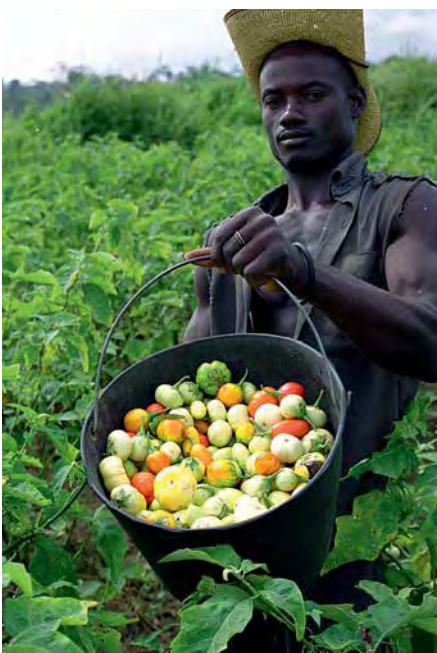
Harvest of African eggplant, Ivory Coast.

Vegetable production in and near cities is called peri-urban production. It is practiced within a distance of some hours to the urban market, in marshy places, near rivers or anywhere where irrigation water is available 2 (Fondio et al., 2007). These producers grow vegetables with a short shelf life: leafy vegetables (amaranth, African nightshade, jew's mallow, baselle, sorrel, African kale, etc.), okra, tomato, eggplant, peppers but also exotic species like carrots, let-