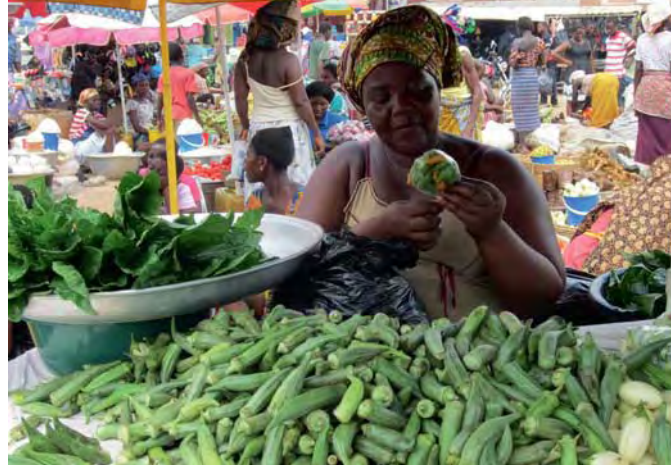
••••• Vegetable market, Benin.

youth and their parents. The agronomy sector and the health care sector should join their efforts to eradicate hidden hunger.