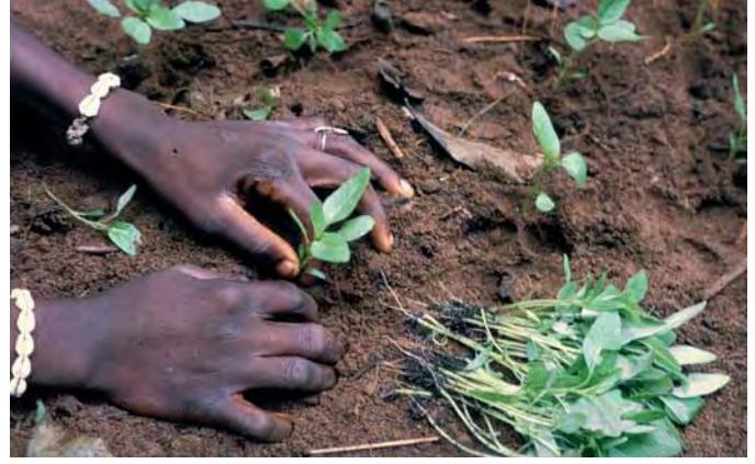
Planting amaranth, Benin.