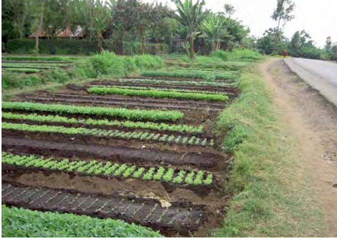
Roadside nursery, Tanzania.