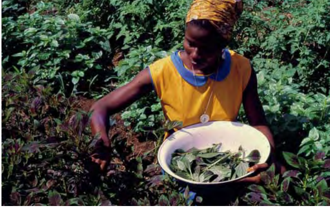
Lagos spinach in home garden, Benin.