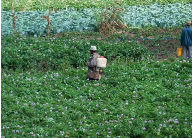
••• Spraying potatoes, Tanzania.