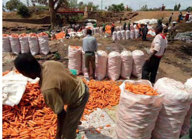
••• Washing and preparing carrots for transport, Tanzania.

the cities, some families grow vegetables on a small scale in their compounds. A rough guess is that about 30% of all vegetable production in tropical Africa consists of cultivated vegetables in the field, with home gardens supplying mainly for personal consumption.