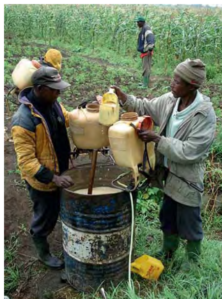
Mixing pesticides, Tanzania.