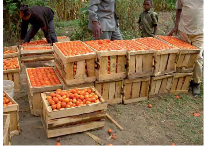
Preparing tomatoes for transport, Tanzania.

quence of historical background and different agro-ecological conditions, differences between countries and regions are large. For instance, African kale (sukuma wiki) is the number one vegetable in Kenya, but is unknown in West Africa. Lagos spinach is very popular in the coastal area of Nigeria and Benin, but almost unknown in most African countries.