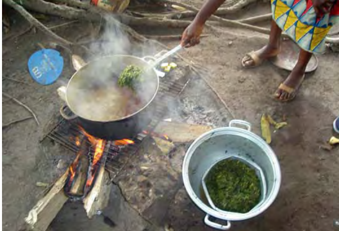
Preparing vegetables in the kitchen, Ivory Coast.