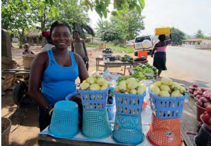
••••• Roadside selling of vegetables, Ghana.