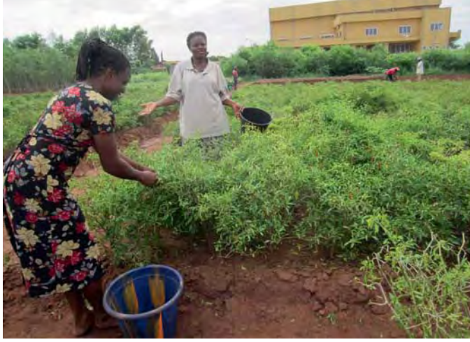
Peri-urban hot pepper harvesting, Ghana.