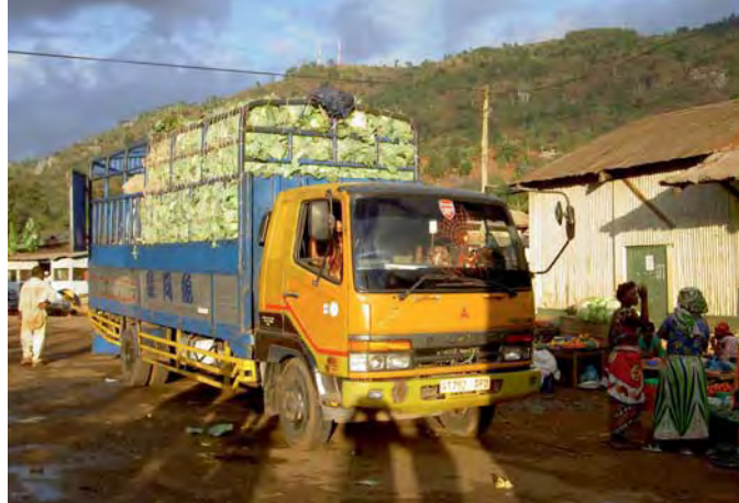
Bulk transport of cabbage, Tanzania.