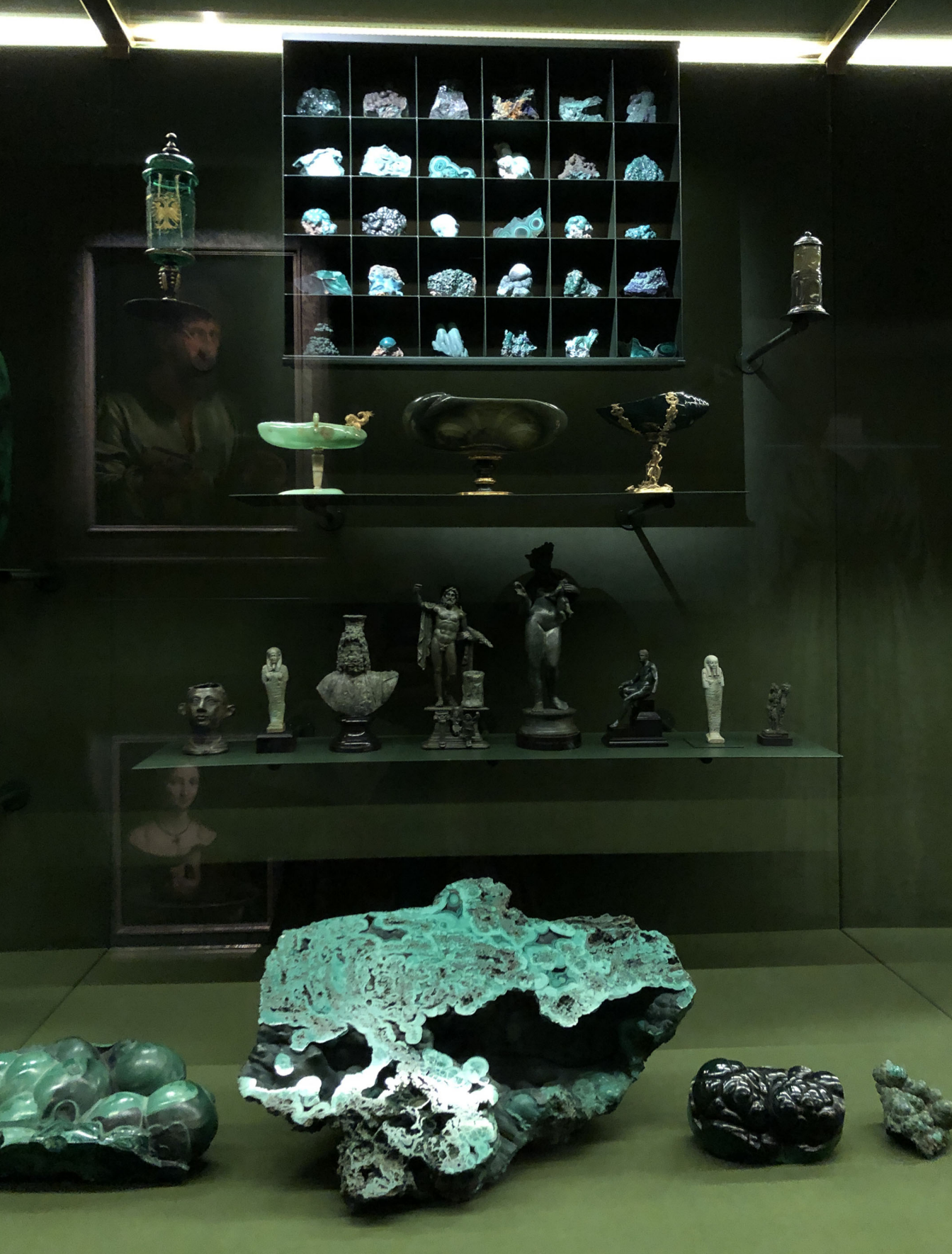
Figure 5. Exhibition View: Green Room detail, objects 17-67.