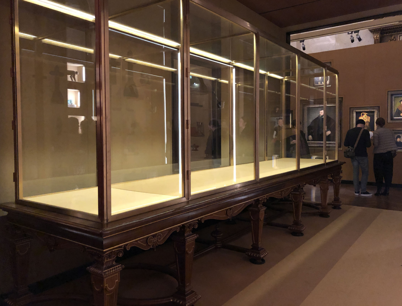
Figure 4. Exhibition View: Vitrine from the Original Furnishings of the Collection "Kunst industrieller Gegenstände" (today Kunstkammer ).

encouraging visitors to engage with the objects aesthetically rather than contextually or narratively. The visual impact of the exhibition extends outwards from the gallery itself: Malouf's object illustrations can be found throughout the KHM in the places from where those objects have been temporarily removed. For those looking for a verbal element, the non-complimentary, optional audio tour provides a deeper insight into the decisions behind some of the object selections and ordering principles, as well as the curatorial processes of Anderson, Malouf, and Sharp.