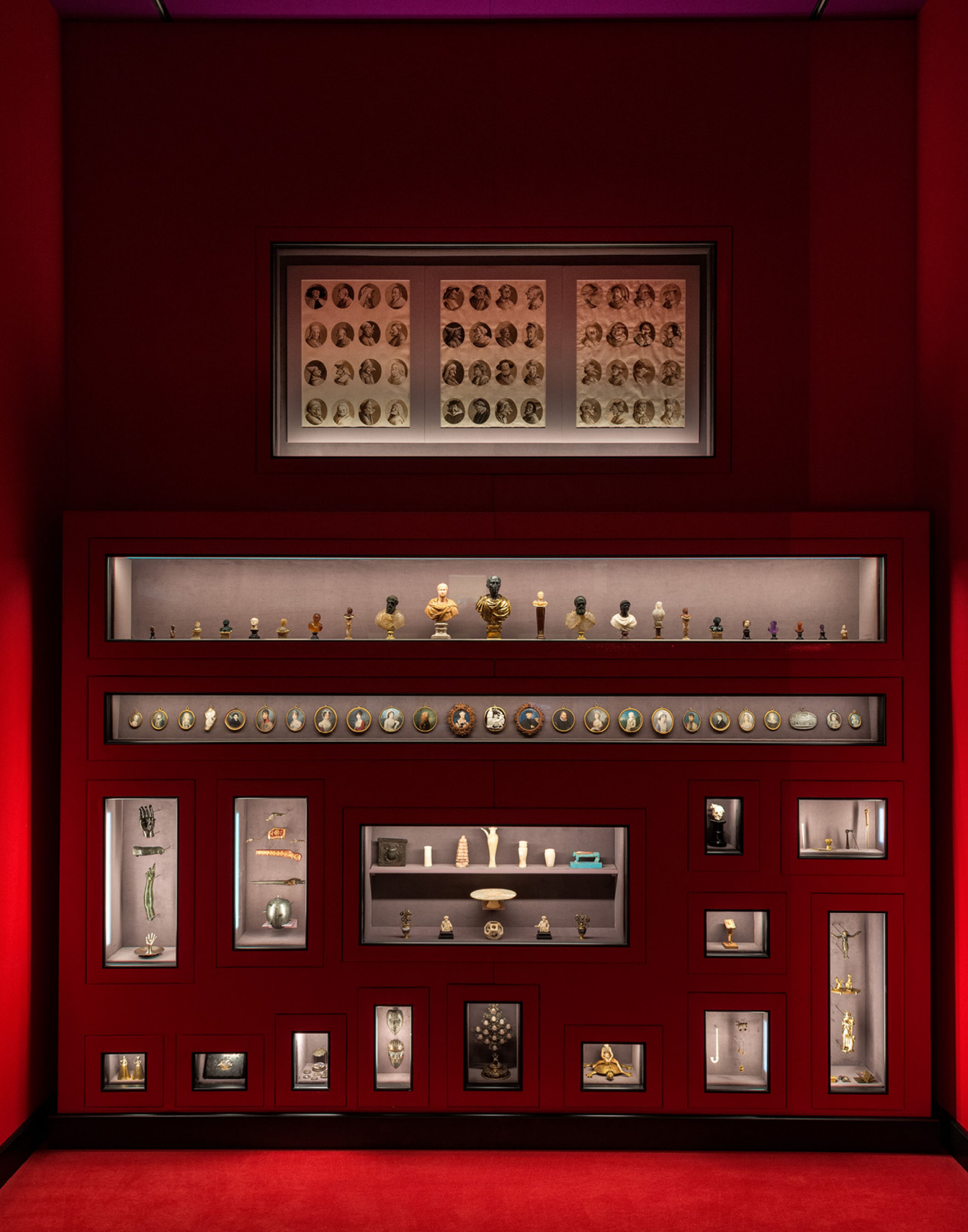
Figure 2. Exhibition View: Miniatures Room.