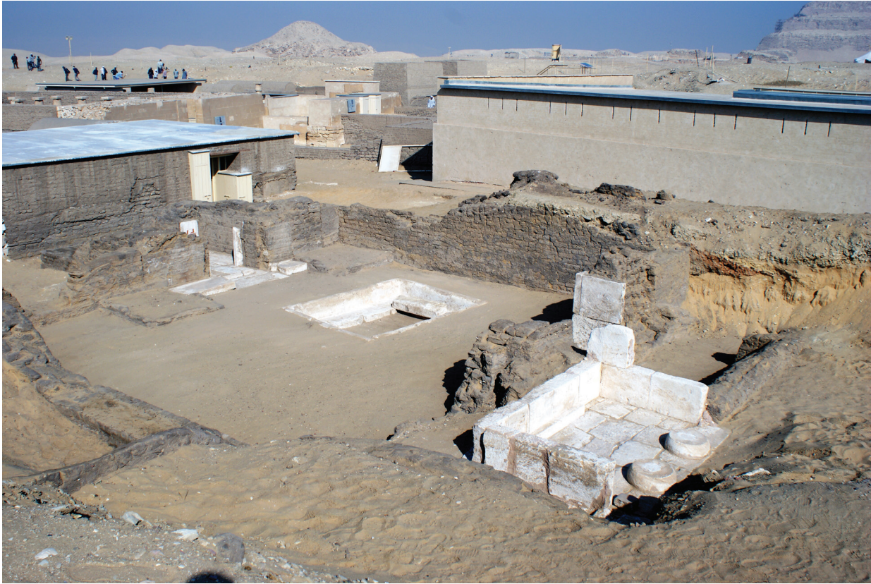
Figure 13.3. The tomb of Ry and chapel 2013/7 after excavation in 2013, looking north-west.

“...at Saccarah, near Memphis, on the chain of hills which separates the left bank of the Nile from the sands of the deserts (...) not more than a quarter of an hour from ‘the town of Memphis’.” 60