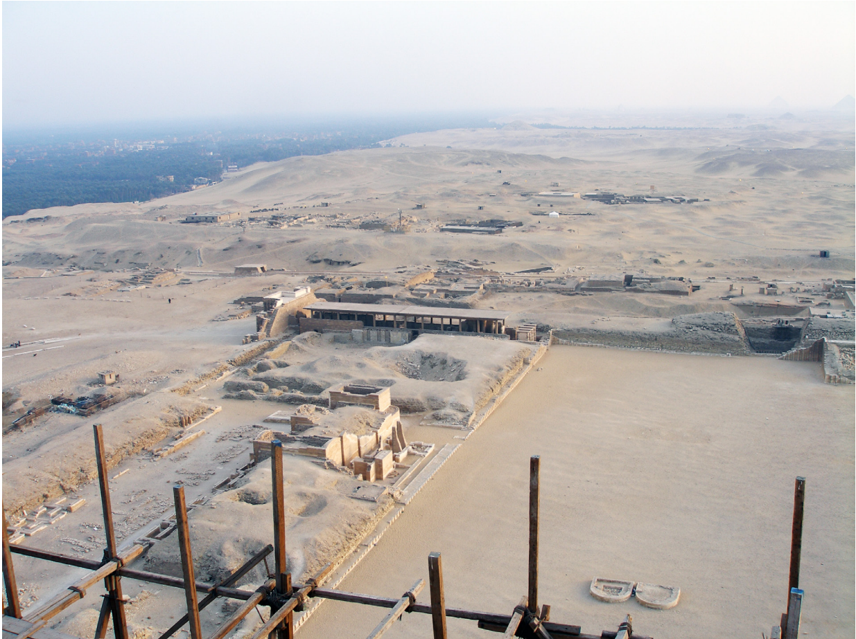
Figure 13.1. View of the Unas South Cemetery, Saqqara, from atop the pyramid of Djoser, looking south.

(materialised in their tombs) thus potentially continued to influence the actions of future generations – hence ‘The Walking Dead’.