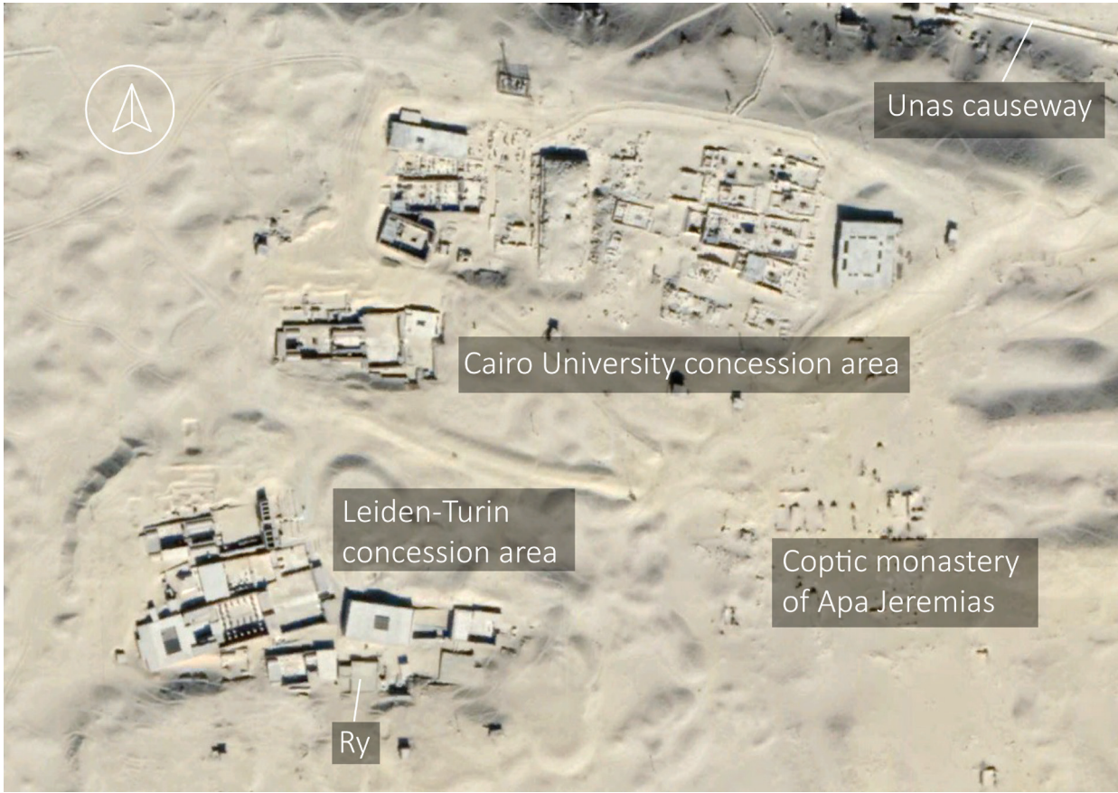
Figure 13.4. Satellite image of Saqqara showing the New Kingdom tombs in the Unas South Cemetery.