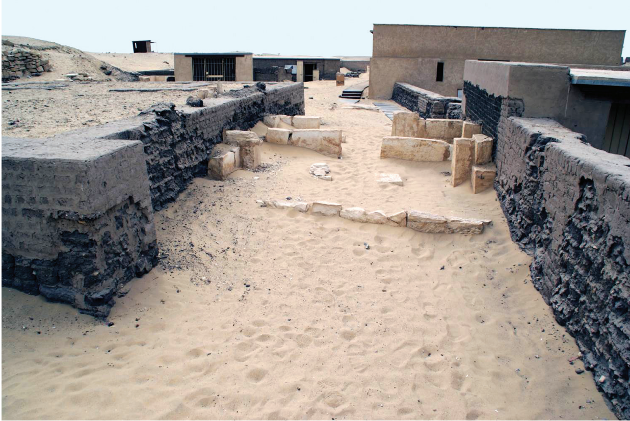
Figure 13.7. Chapel 2007/10, looking west, built between the tombs of NN (left) and Ptahemwia (right).

to the north stood the tomb of Mery-Neith, the Greatest of Seers (high priest) and the Steward in the temple of the Aten in Memphis ( temp. Akhenaten-Tutankhamun); and his neighbours to the east and south are still unknown. Moreover, located within a radius of 50 metres were the tombs of two of the most influential officials of Tutankhamun's tenure: Horemheb, the Generalissimo (several building phases), and Maya, the Overseer of the Treasury and Overseer of Works on All Monuments of the King. The latter may have been buried as late as year 9 of king Horemheb. 72 When we add to these archaeologically excavated tombs the prosopographic information recorded on tomb-elements taken from the same section of the cemetery (now kept in museum collections worldwide), the image of a field reserved exclusively for courtiers emerges. Thus, the court cemetery includes stewards of temples of Millions of Years (the temples that are located at the foot of the escarpment), high-ranking army officials (incl. royal butlers), overseers of (royal) construction works, "harim" officials, and high priests. 73