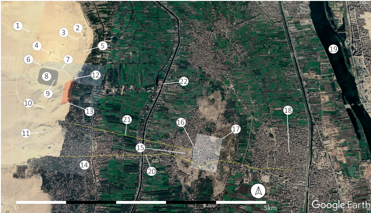
Figure 13.2. Satellite image of the Memphite region, showing the location of ancient Memphis and the desert plateau at Saqqara. Image by Google Earth, adapted by Nico Staring. Legend: 1. Serapeum | 2. Pyramid of Menkauhor | 3. Pyramid of Teti | 4. Pyramid of Djoser | 5. 'Bubasteion' rock-cut tombs | 6. Pyramid of Unas | 7. Unas causeway | 8. Unas South Cemetery | 9. 'Ras el-Gisir' | 10. Wadi Tabet el-Guesh | 11. Pyramid of Pepi I | 12. Valley temple of Unas | 13. Proposed location of New Kingdom temples of Millions of Years | 14. Modern village of Saqqara | 15. Ancient Memphis | 16. Temple of Ptah, West Gate, Ramesside period | 17. Temple of Ptah precinct | 18. Modern city of Bedrashein | 19. River Nile | 20. Bedrashein-Saqqara road | 21. Shortest route from New Kingdom Memphis (temple of Ptah) to the necropolis at Saqqara | 22. Bahr el-Libeini.

The text concludes with Ptahmose who expresses the wish to continue to participate in the festival forever: