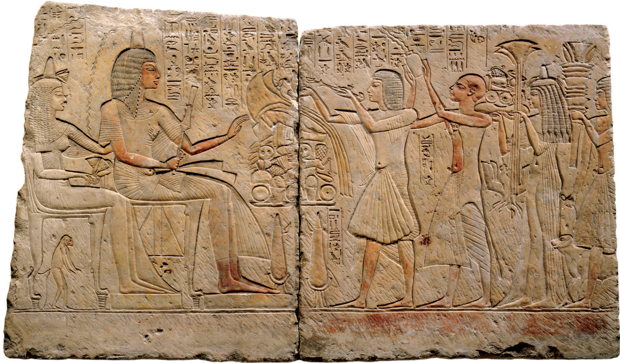
Figure 13.8. Relief-decorated blocks (Berlin inv. no. ÄM 7278) from the north wall of Ry's tomb (antechapel), showing the deceased couple (left) and a group of offering bearers and officiants (right).

the positioning of funerary monuments elsewhere in the cemetery. Anonymous chapel 2007/10 (figs 13.6 and 13.7), situated a mere 50 metres west of Horemheb's entrance pylon, serves as an example. It may have been built along one of the prevailing access routes leading up to the tomb-temple of the deified king. Visitors passed through the street in between the monumental tombs of Ptahemwia and NN when they arrived from the valley below. By building a chapel at precisely that location, the owner of chapel 2007/10 deliberately blocked one possible route leading up to the king's monument. Future visitors, entering the cemetery from the southern Tabet el-Guesh or Ras el-Gisir approach, now had to pass by this chapel and make a detour to reach the same destination. The choice for that exact location may thus have been the result of strategic decision-making, aimed to attract the attention of a maximum number of passers-by, both in the present and future. The same choice and resulting changes to the cemetery infrastructure also affected the accessibility of other, pre-existing tombs, both positively and negatively.