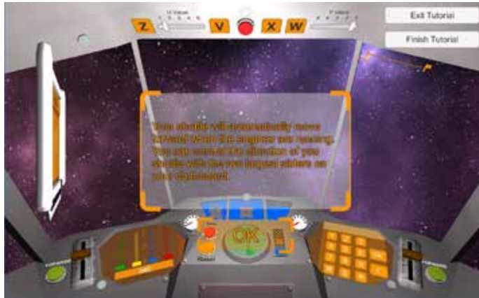
Figure 5.2: Shuttle to Mars screenshot: on-screen instructions in tutorial

The player needs to follow the instructions given in order to proceed through the tutorial. The player receives feedback when completing the actions. By doing so, he explores how the spaceship is operated and what rules apply in the game.