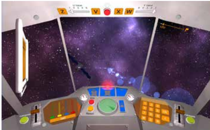
Figure 5.3: Shuttle to Mars screenshot: flight path shown as blue bubble trail

The challenges in the game will build up to meaningful events that have a strong link to the actual situations that a pilot may encounter in his job. The parallels created with these events are intended to stimulate transfer of the competencies from the game to the actual work environment. This will be discussed in more detail in Subsection 5.3.2.