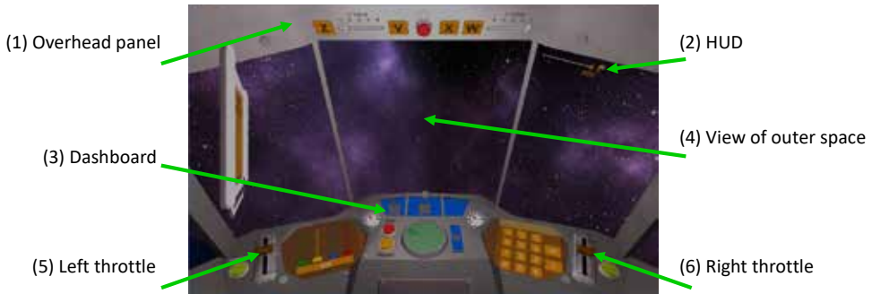
Figure 5.1: Shuttle to Mars screenshot: cockpit

The speed of the spaceship is automatically controlled, but the player is responsible for keeping the spaceship on the designated path through space. He must steer his spaceship, using the (5) left and (6) right throttles (see Figure 5.1), to avoid obstacles.