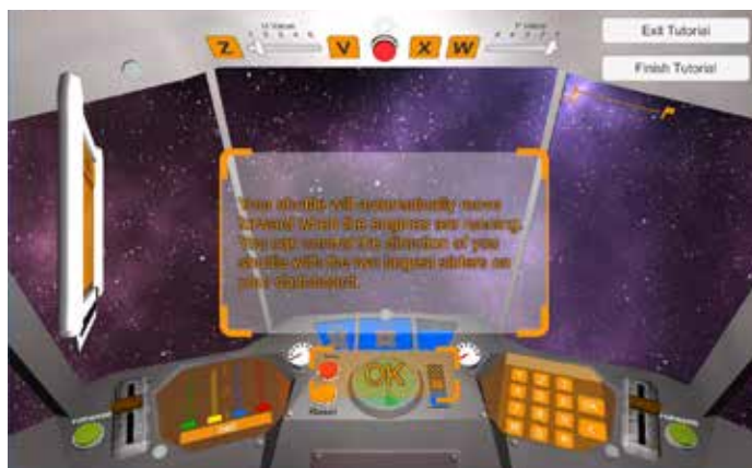
Figure 5.2: Shuttle to Mars screenshot: on-screen instructions in tutorial

The player needs to follow the instructions given in order to proceed through the tutorial. The player receives feedback when completing the actions. By doing so, he explores how the spaceship is operated and what rules apply in the game.