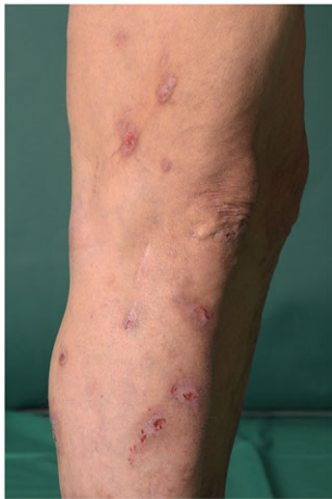
Figure 2 Linear prurigo: a subtype of chronic prurigo. Chronic prurigo may present with various clinical manifestations, including papular, nodular, plaque-type, umbilicated and linear lesions. These share common core symptoms and associated criteria and belong thus to the spectrum of chronic prurigo. A representative chronic prurigo lesion of nodular type is shown.