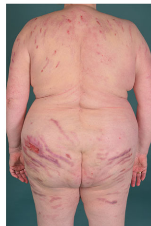
Figure 1 Patient with representative linear prurigo lesions.

TFP members agreed that chronic pruritus underlies LSSL, and that LSSL occur due to prolonged scratching, and may appear in localized areas or occur generalized over the whole integument, sharing thus characteristics with papules, nodules, plaques or umbilicated lesions belonging to the spectrum of CPG. In fact, TFP members consented that LSSL show common pathophysiological mechanisms to CPG and may overlap with CPG lesions in the same individual. As a result, LSSL were considered as belonging to the spectrum of CPG by a vast majority of the participants (90%), being a further subtype of this condition (Fig. 2). The term 'linear prurigo' was chosen to describe this manifestation. Finally, TFP members agreed that linear prurigo should be differentiated from skin picking syndromes, in which artificial manipulation, rather than pruritus itself and subsequent scratching, leads to the development of the lesions.