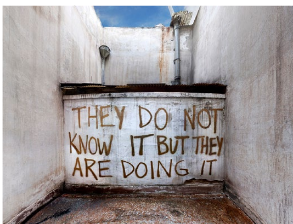
Figures 4 and 5. Untitled (2011) by Stefania Strouza. Gold spray paint on two sides of a 2.10 x 2.90 m wall. Installation view from the exhibition 'Summer in the Middle of Winter', Kunsthalle Athena, Athens, Greece.

The phrases are English translations of quotes from Karl Marx's Das Kapital and Sophocles' Antigone respectively, written with gold spray paint and placed as each other's mirror images on the two sides of the exhibition's central wall (Figures 4 and 5).