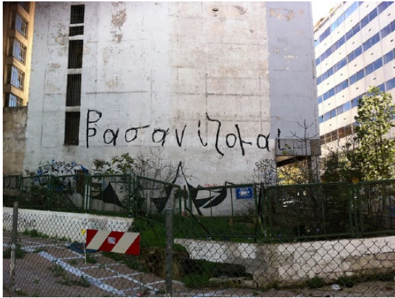
Figure 2. The wall-writing vasanizomai in Stadiou Street, Athens, 2014.

and sees pain as ‘the most powerful aid to mnemonics’: ‘A thing must be burnt in so that it stays in the memory: only something that continues to hurt stays in the memory’, he writes (2006: 38). Eventually, debt can drive the debtor to self-torture – something Nietzsche links with Christian morality. The ‘bad conscience’ that debt produces leads man to inflict ‘self-torture with its most horrific hardness and sharpness. Debt towards God: this thought becomes an instrument of torture’ (Nietzsche, 2006: 63). Bringing Nietzsche’s views to bear on today’s finance capitalism, Lazzarato finds that the process Nietzsche lays out applies to the way capitalism constructs ‘a person capable of promising: labor goes hand in hand with work on the self, with self-torture, with self-directed action’ (2012: 42).