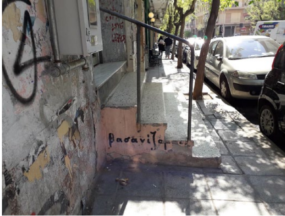
Figure 3. The wall-writing vasanizomai in Arrianou street, Thessaloniki, 2019.

voices. Nevertheless, there are still linguistic constructions that convey the meaning of the middle voice either through passive or active verbs. In such constructions, the subject is inside the designated process or action (Benveniste, 1971: 148; Pecora, 1991: 210) but the agent causing the action often remains unspecified or ambiguous.