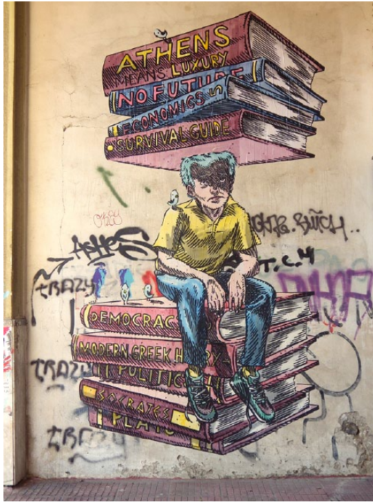
Figure 1. Dimitris Taxis, 'I Wish You Could Learn Something Useful from the Past' (91 Kerameikou Street, Athens, 2013).

constitutive role history has played in the modern nation's identity. The classical heritage, particularly, has been key to processes of nation-building (Hamilakis, 2007; Plantzos, 2017: 68) and has functioned as the country's symbolic capital in Europe. But it has also at times turned into a painful reminder of the discrepancy between the classical ideal and the Greek present, generating an image of modern Greece, as Lord Byron put it in 'Childe Harold's Pilgrimage', as a 'sad relic of departed worth' (Byron, 2004[1812–1818]: canto 2, stanza 73; Boletsi, 2018b: 7, 28; Liakos, 2016: 208). 1 In Taxis' graffiti, the debt of the Greeks to their past – especially the classical past, as suggested by the books referring to Greek philosophers – becomes superimposed on the financial debt at the heart of the so-called Greek crisis. Although these debts are of a different kind, in the crisis-years they became imbricated in multiple ways (Hamilakis, 2016: 238–239; Hanink, 2017; Talalay, 2013).