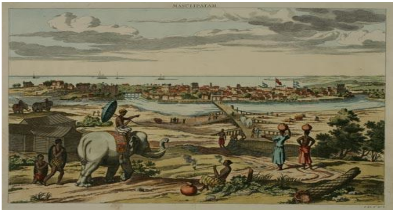
Figure 1.1: Seventeenth-century Masulipatnam 36