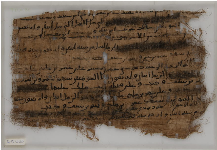
Fig. 1: P. Louvre inv. J. David-Weill 20.

A decade ago, Yūsuf RĀĠĪB published a fragmentary seventh-century CE papyrus from Egypt, P. Louvre inv. J. David-Weill 20, containing a series of debt acknowledgements (Ar. sing., dhikr ḥaqq 4 ). All of the debt acknowledgements in the legible part of this document bear the perplexing phrase snh qaḏā' al-mu'minīn , which occurs invariably after the dating formula. 5 RĀĠĪB read the phrase as sanat qaḏā' al-mu'minīn and understood it to be a designation for the new hijrī era introduced into Egypt by its Muslim conquerors, translating it as “l’année de la juridiction des croyants”. 6 More recently, however, Jelle BRUNING has cast doubt