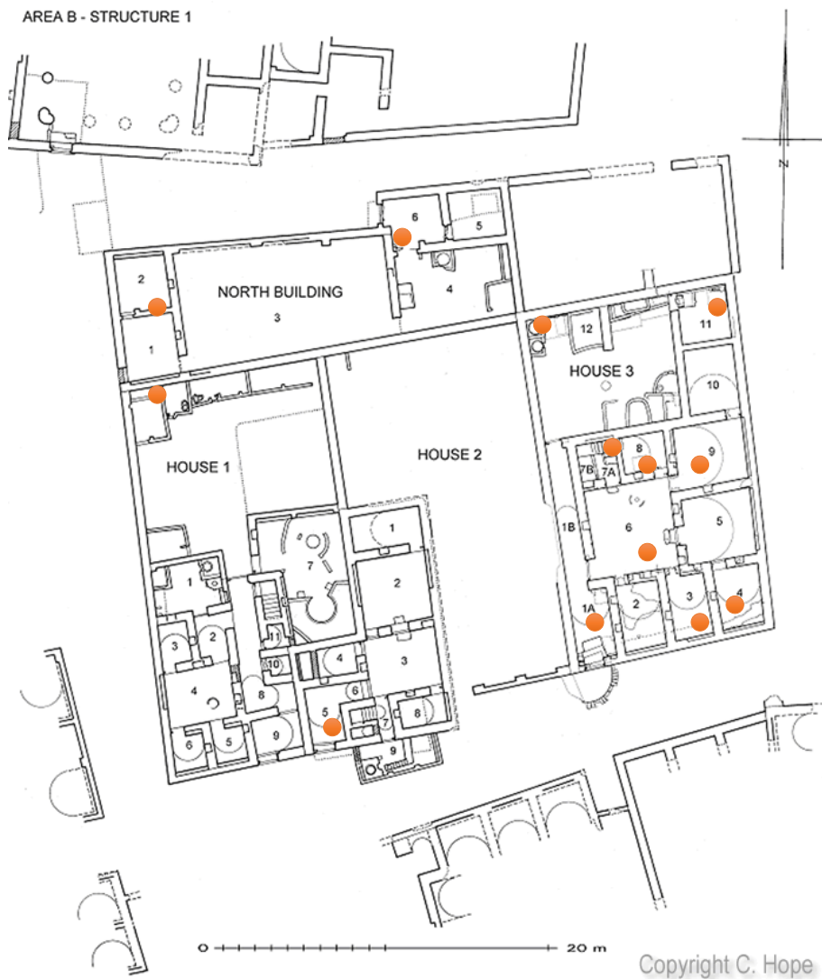
Figure 17: Find locations in Houses 1–3. Modified to indicate the location of the documents.

Makarios derived from Room 6 in House 3, with a single exception found in room 3 (P.Kell.Copt. 24). 56 The location of the various rooms that have been discussed are indicated in Figure 17.