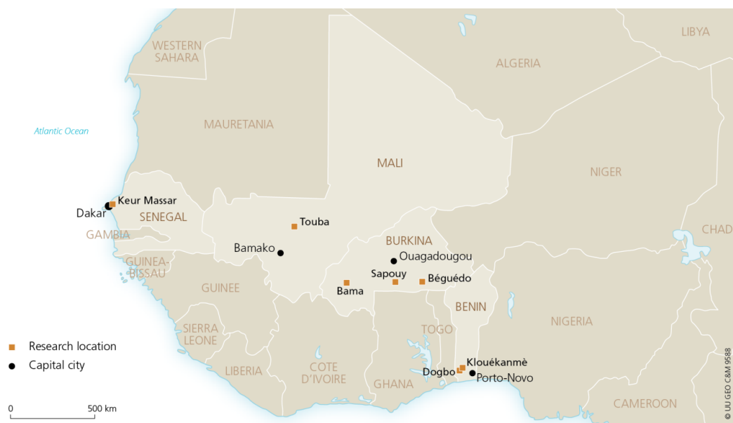
Figure 1. Overview of research locations.

Starting from the question about how land investments and migration trajectories of West African youth and their families are interrelated, each case study has explored the influence of remittances, return migration, and character of the diaspora (old, new, males, families) on land investments. They have also examined the influence of land degradation, land speculation, land ownership, and land investment on migration. However, rather than prescribing a strict format, the researchers for each of the four case studies were relatively free to choose their particular focus, depending on the characteristics of their respective settings. Research was conducted by teams of local researchers (except for the Senegal case study, which was done by Kaag). Field reports were then produced [33–35] (see also [36]). The combined research results are presented in the following section.