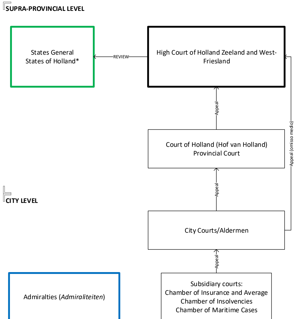
Figure 2: The legal framework of Holland and Zeeland

Based on LeBailly and Verhas, Hoge Raad ; Punt, Het vennootschapsrecht . *While LeBailly and Verhas write that High Court sentences were reviewed by the States General, Punt states that it was the States of Holland which reviewed them