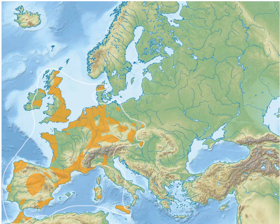
Fig. 3.4 Distribution map of the BB complex in Europe (after Schnurbein 2009, 79; base map: Wikimedia Commons).

‘package’ is complemented with copper spearheads, known as Palmela points (Vander Linden 2006b, 323), whereas stone archer’s wristguards are largely absent in northern Germany and southern Scandinavia (Sarauw 2006, 66).