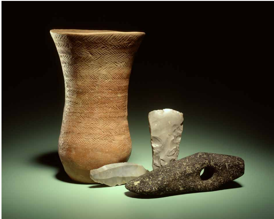
Fig. 3.2 Grave assemblage of a CW burial near Renkum (AMP0424), objects include a type 1d beaker, a northern flint blade, a flint axe and a battle axe.

Allentoft et al. 2015; Parker Pearson et al. 2016; Knipper et al. 2017; Olalde et al. 2018). Samples taken from CW individuals show a close relatedness to peoples living in the Steppes, most notably the Yamnaya culture (originating in eastern Ukraine and adjacent parts of western Russia). These papers speak of ‘massive’ migrations of large groups of people over vast distances, indicating that Childe’s original interpretation might actually not have been that far off. Some evidence even indicates that new people not only came in, they took over. This can be inferred from a recent paper by Olalde et al. (2018) where it is presented that after the influx of Steppe people more than 90% of Britain’s gene pool was replaced. The influx of people from the Steppe also gives new credence to the spread of Indo-European languages as part of these migrations from what is generally seen as the heartland of Proto-Indo-European (see Anthony 2007; Kristiansen et al. 2017).