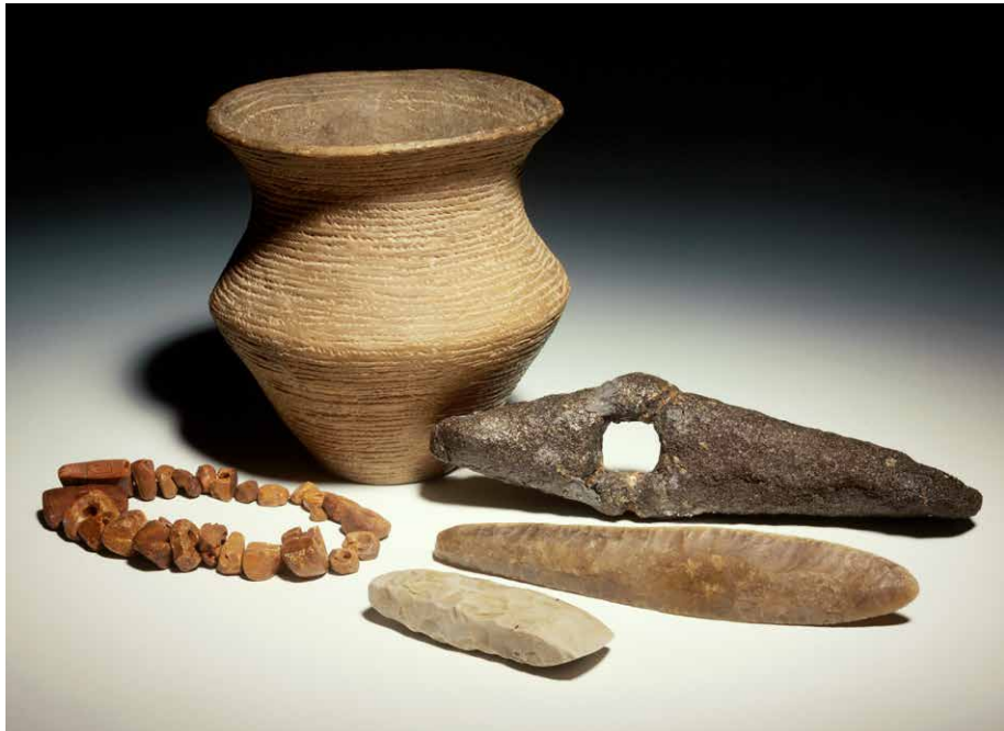
Fig. 3.3 Grave assemblage of the AOO grave from mound 4, Garderen Solsche Berg (AMP0257), objects include an All Over Corded Beaker, amber bead necklace, flint axe, Grand-Pressigny flint dagger and a battle axe (collection and photography: National Museum of Antiquities, Leiden).

and Hogestijn 1999, 104; 2007, 76; Lanting 2008, 15). 21 This almost evolutionary trajectory, where CW beakers transformed into AOO beakers and subsequently into bell beakers, however, formed the main reason why many researchers placed the origin of the BB complex in the Lower Rhine Basin, the so-called ‘Dutch-Model’ (referring to the typological model as presented by Lanting and Van der Waals 1976).