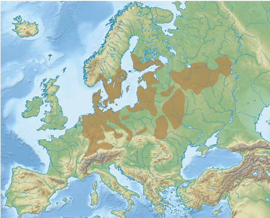
Fig. 3.1 Distribution map of the CW culture in Europe (after Schnurbein 2009, 79; base map: Wikimedia Commons).

ious new types of material culture (most notably the cord-decorated beaker), this included new burial practices that now typically involve single inhumations covered by relatively small and low burial mounds (Bourgeois 2013; Hübner 2005, 472; Midgley 1992, 488). These single graves , situated underneath small mounds, usually contain various types of grave goods (see Fig. 3.2). Some of these are traditionally interpreted as weapons and are hence seen as evidence for the rise of warfare as an ideologically laden activity. Given their association with a single individual, these objects are moreover seen as proxies of a ranked social system and the rise of hierarchy or social stratification (see Vandkilde 2005, 10; Hübner 2005, 637; 964; Drenth and Lohof 2005, 447).