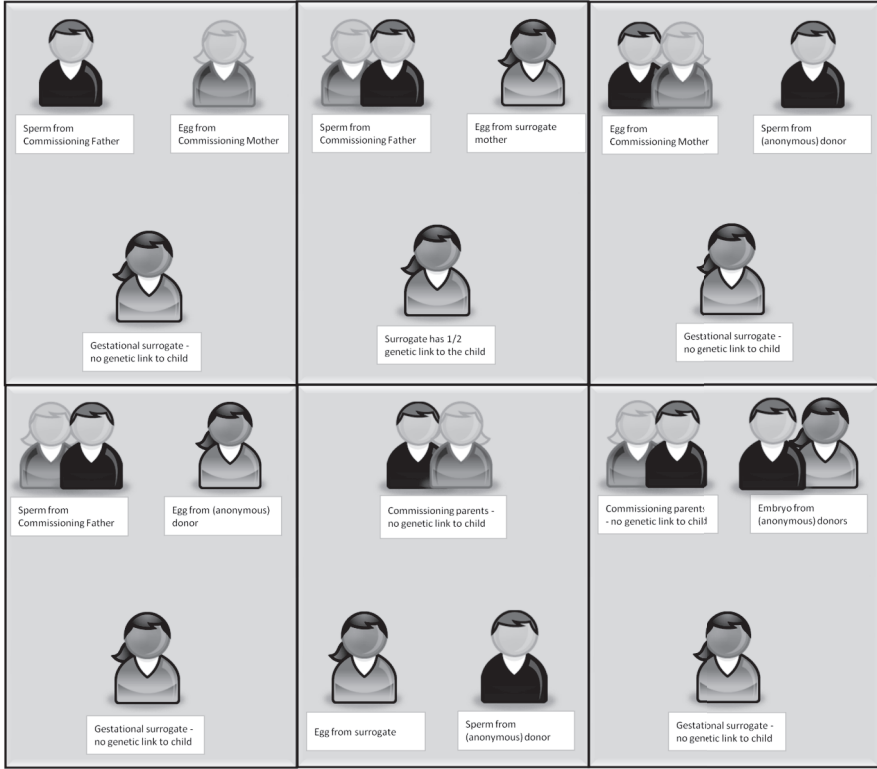
Figure 1: the main models of international commercial surrogacy

Given the above, an ICS arrangement could lead to a scenario, for example, whereby a heterosexual couple in New Zealand pays a clinic in Thailand for the implantation of the male’s sperm, combined with an ovum purchased from the United States, into a Thai surrogate mother who gives birth in Thailand. Alternatively, consider the scenario described in a recent article: “In a hospital room on the Greek island of Crete with views of a sapphire sea lapping at ancient fortress walls, a Bulgarian woman plans to deliver a baby whose biological mother is an anonymous European egg donor, whose father is Italian, and whose birth is being orchestrated from Los Angeles. She won’t be keeping the child.” 10 Superficially, the complexities of such factual scenarios are immediately apparent, but a further tangle of difficult issues underlies these scenarios, raising numerous potential human rights challenges for the children born and the surrogate mothers involved. These issues will be dealt