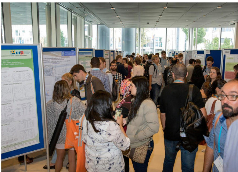
Crowded poster session.