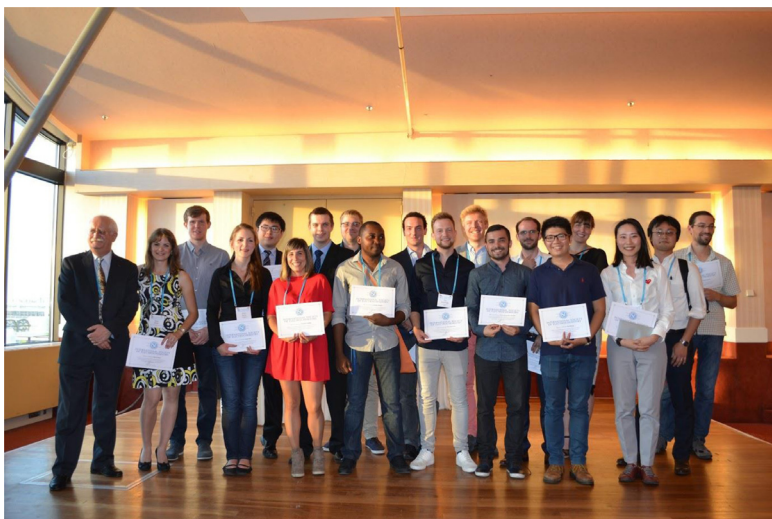
Winners of poster awards.