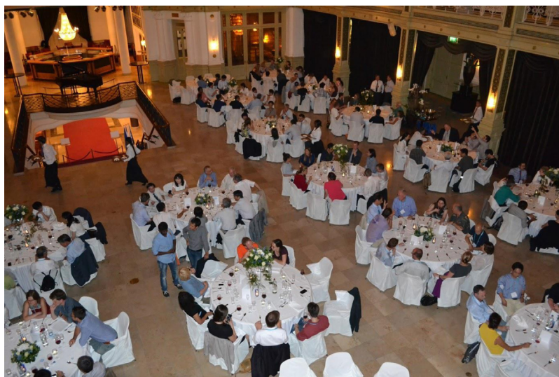
Meeting gala dinner.