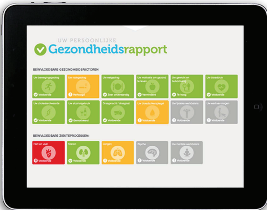
Figure 1. Health report of the Personal Health check

[Beïnvloedbare gezondheidsfactoren] Modifiable health factors: physical activity; smoking; nutrition; motivation for a healthy lifestyle; weight and waist circumference; blood pressure; cholesterol; alcohol; resilience; glucose; physical occupational balance; and occupation capacity.