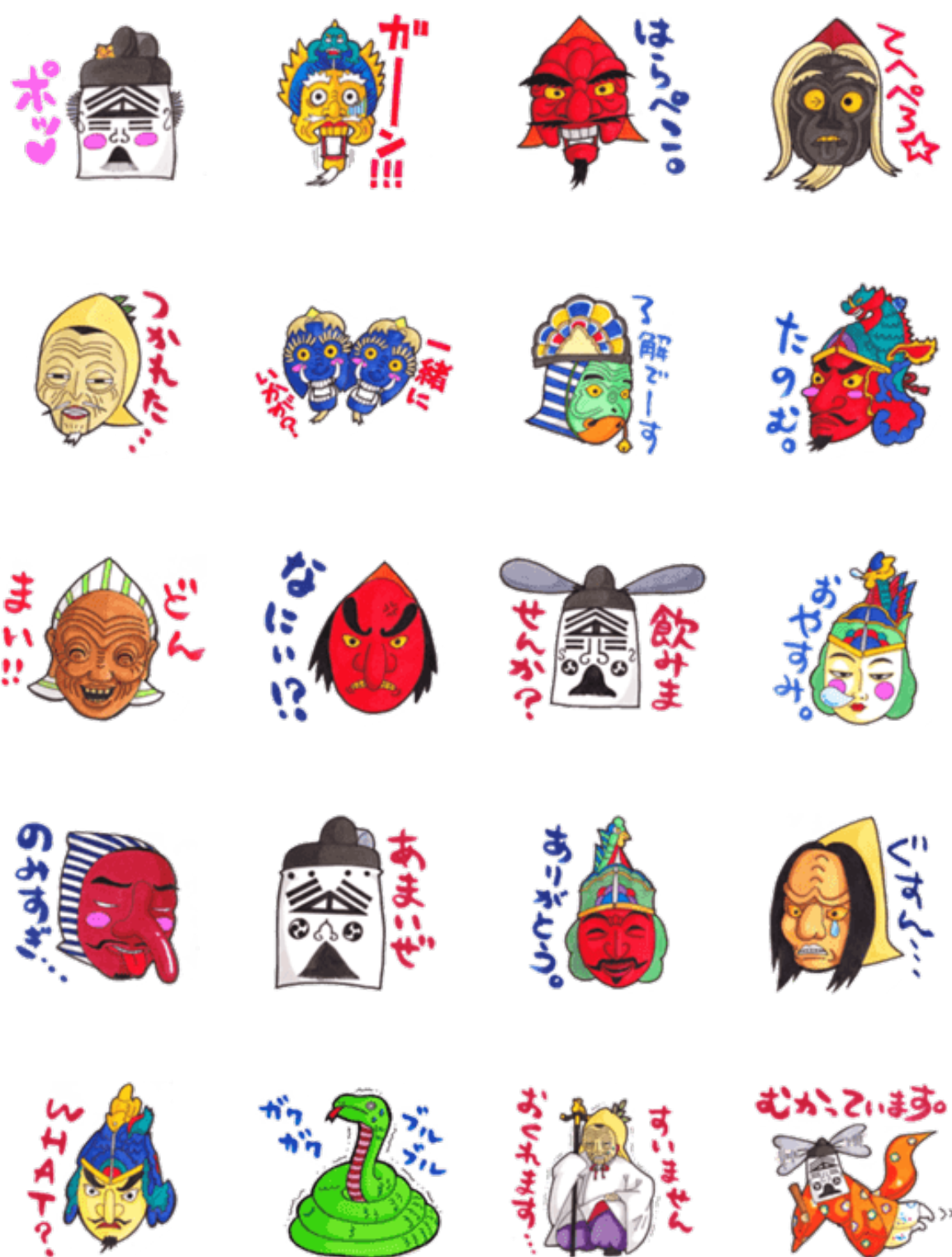
FIGURE 3. In the summer of 2016, the cellphone application LINE launched this series of bugaku -inspired stickers.