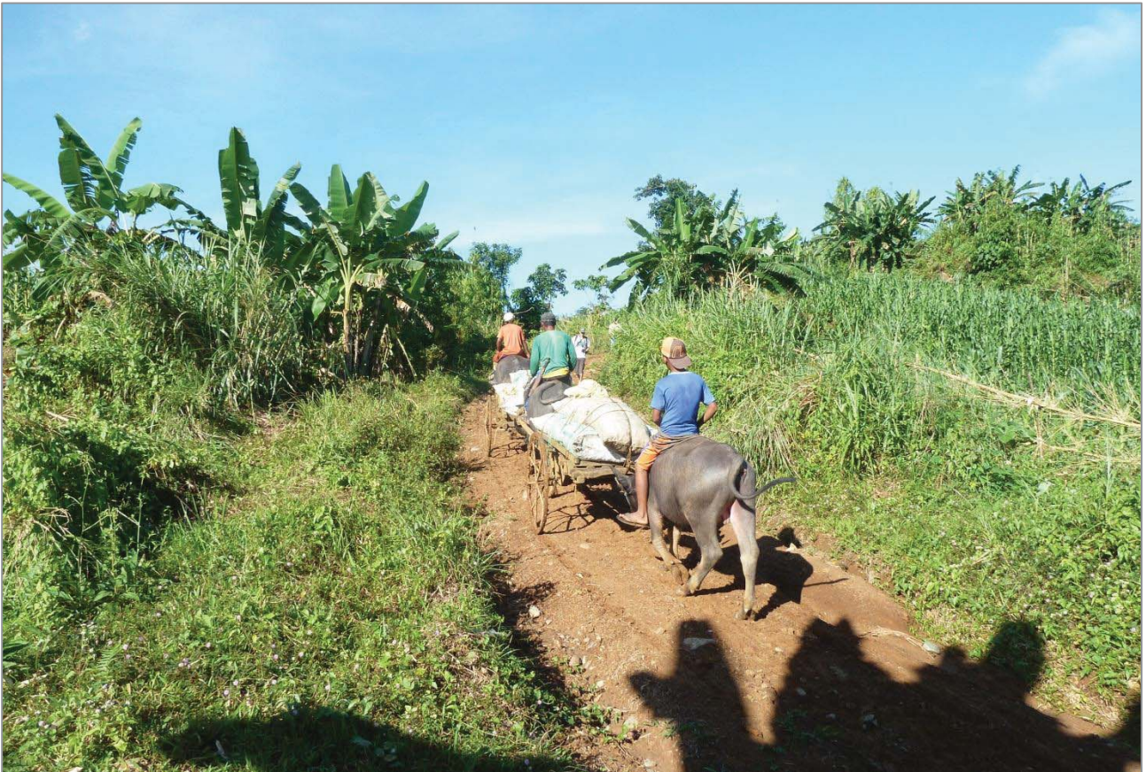
Figure 4. a - b. Traveling on top of water buffalo.