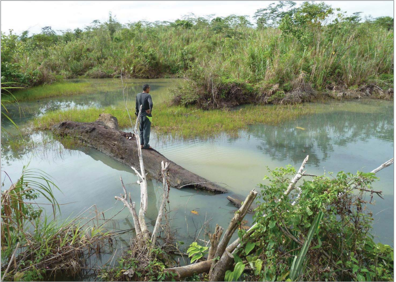
Figure 39. Habitat of the new Paracercion .