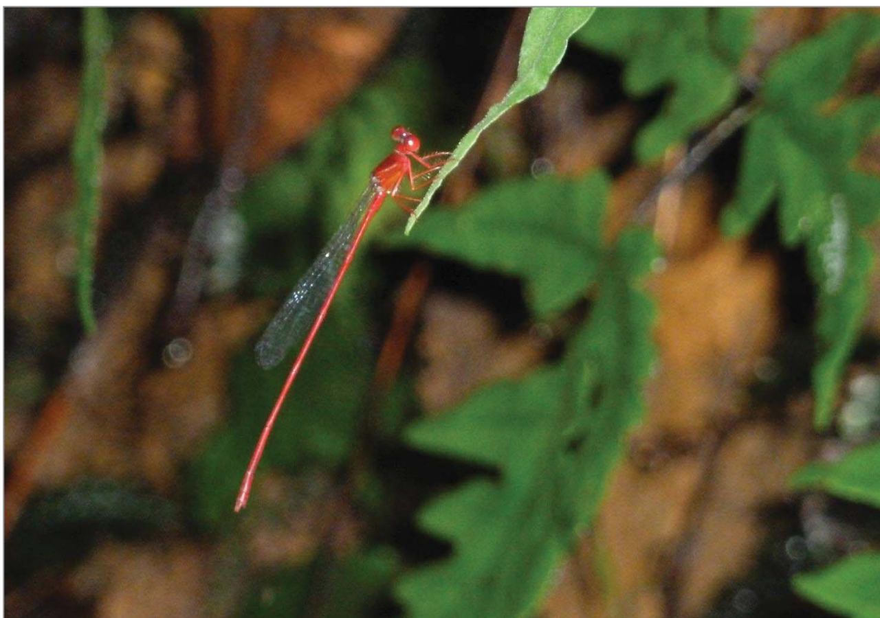
Figure 34. Risio cnemis ignea male.