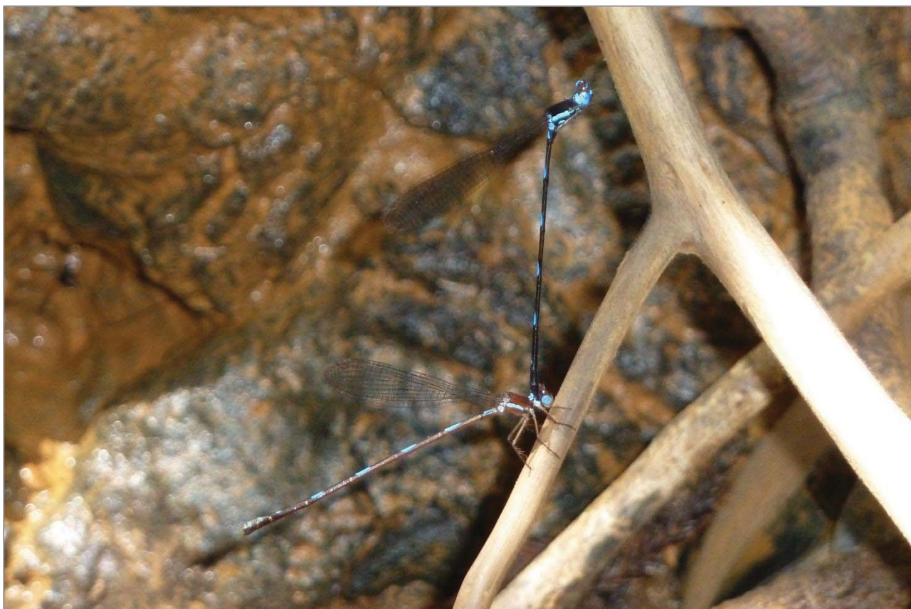
Figure 33. Risio cnemis elegans in tandem. This is the first photo made of this species from the field.