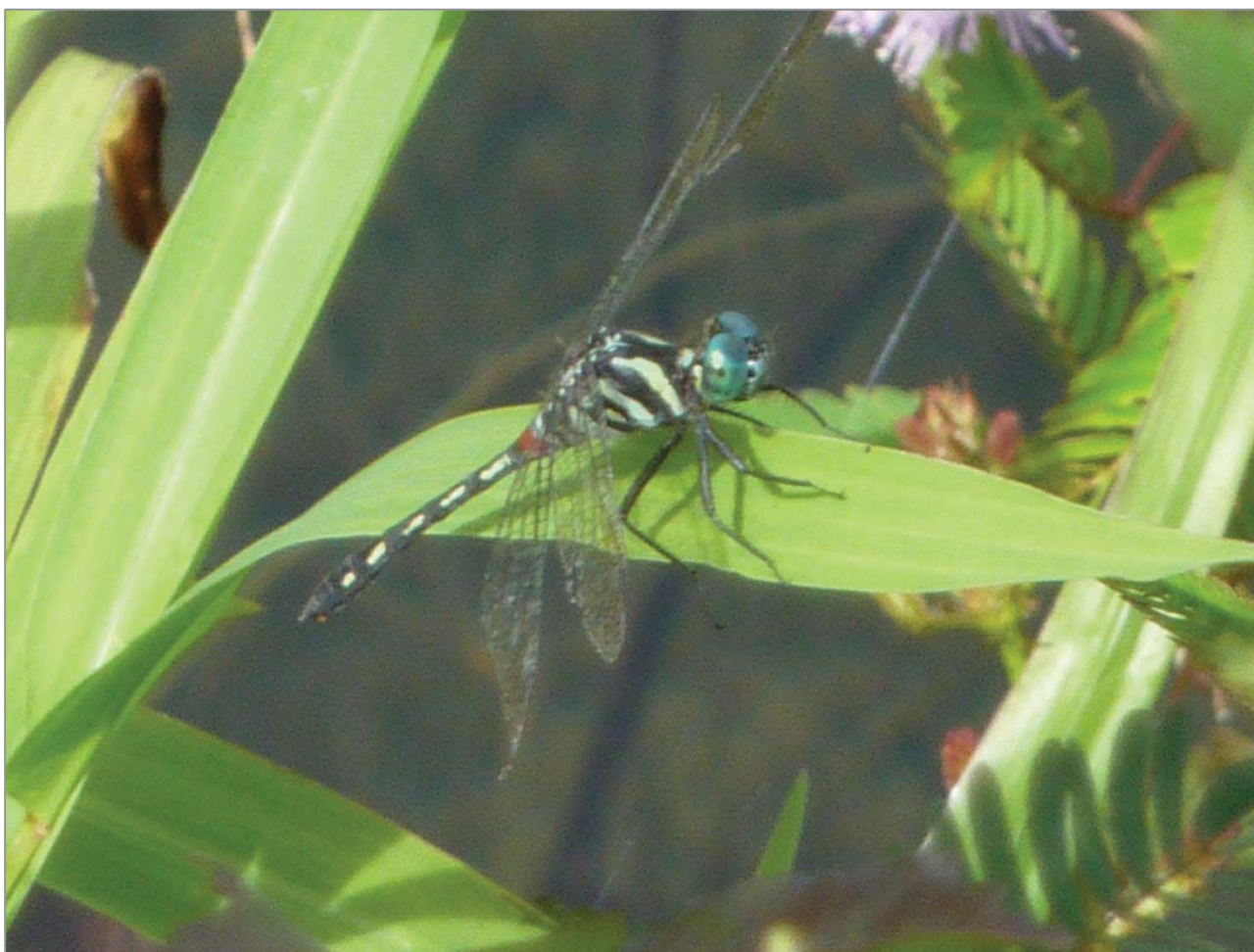
Figure 44. Diplacina braueri male.

Recorded: Malat River, Burdeos, Polillo Is.