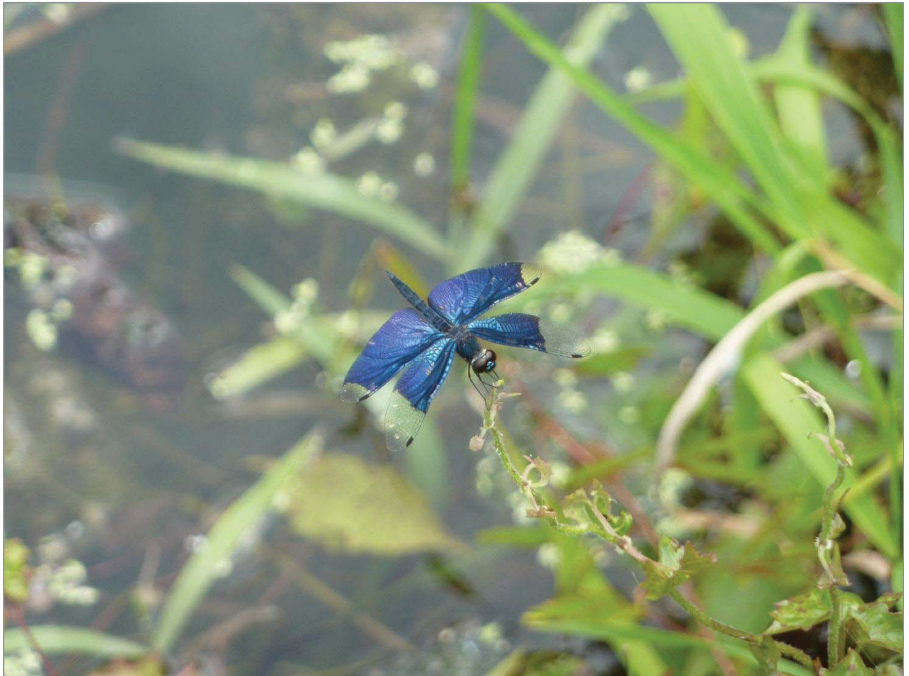
Figure 49. Rhyothemis resplendens male.

Recorded: Dunoy Lake, Brgy. Disulap, San Mariano, Isabela, Luzon Is.; Narra Lake, Brgy. Disulap, San Mariano, Isabela, Luzon Is.