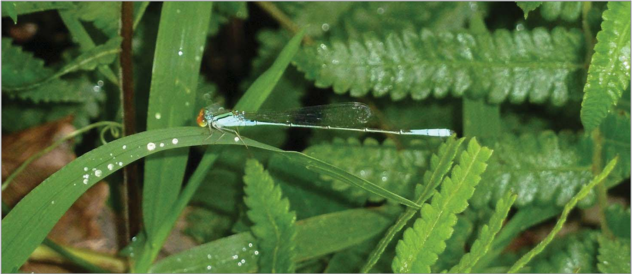
Figure 41. Pseudagrion r. rubriceps male.

Recorded: Dilasag swamp, Dilasag, Aurora, Luzon Is.