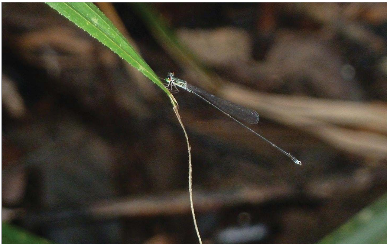
Figure 35. Amphinemesis furcata male.

Recorded: Narra Lake, Brgy. Disulap, San Mariano, Isabela, Luzon Is.; Dilasag swamp, Dilasag, Aurora, Luzon Is. (16° 24' N, 122° 13' E).