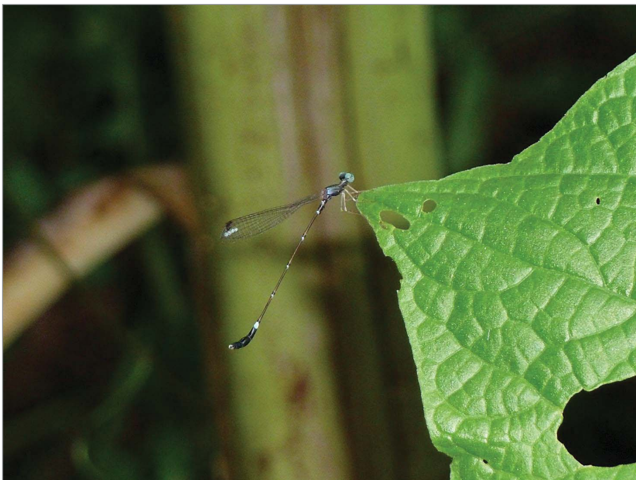
Figure 31. Sulcosticta sp. male.

Remark: A single male was found. The posterior pronotal lobe resembles those of S. pallida van Tol 2005, a species recorded in the nearby province of Nueva Vizcaya. These two species however differ markedly on the structure of the cerci and paraprocts.