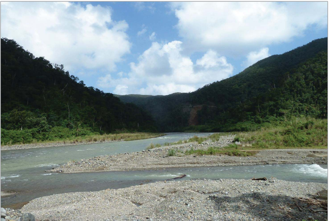
Figure 15 a–b. Sierra Madre Mountain range.