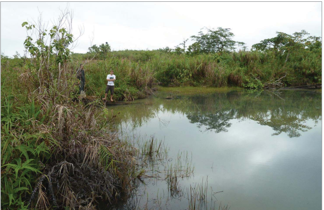
Figure 40. Habitat of the new Paracercion .