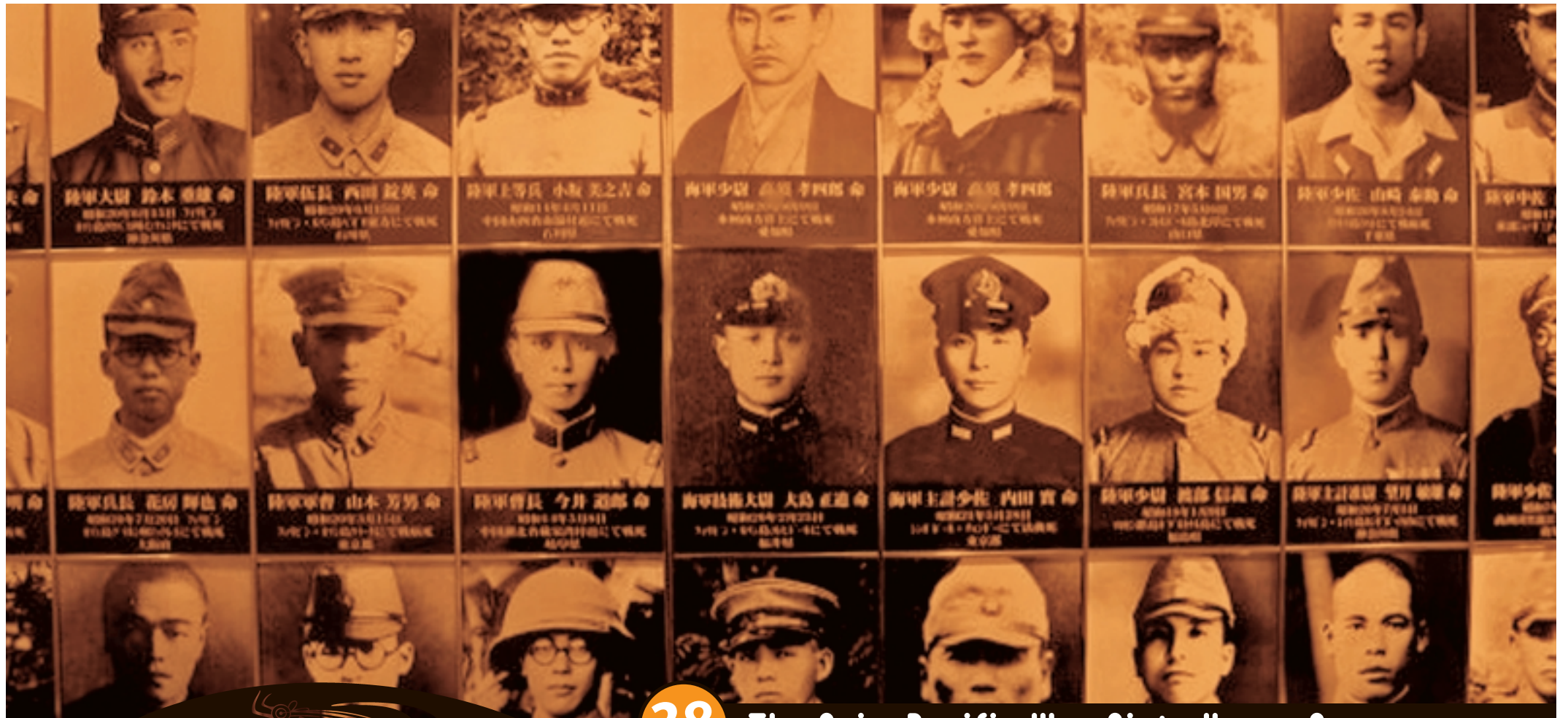
Memorial photos of kamikaze pilots, Yasukuni Shrine.