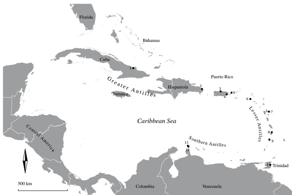
Figure 7.1 Map of the Caribbean showing the two groups based on the predominant direction of molar wear and occlusal surface shape (Pepijn van der Linden and Hayley L. Mickleburgh).

Type 1: (1) Chorro de Maíta, Cuba (2) Punta Macao, Dominican Republic (4) Punta Candelero, Puerto Rico (6) Kelbey's Ridge 2, Saba (9) Escape, St. Vincent (10) Manzanilla, Trinidad (11) Canashito, Aruba (12) Savaneta, Aruba.