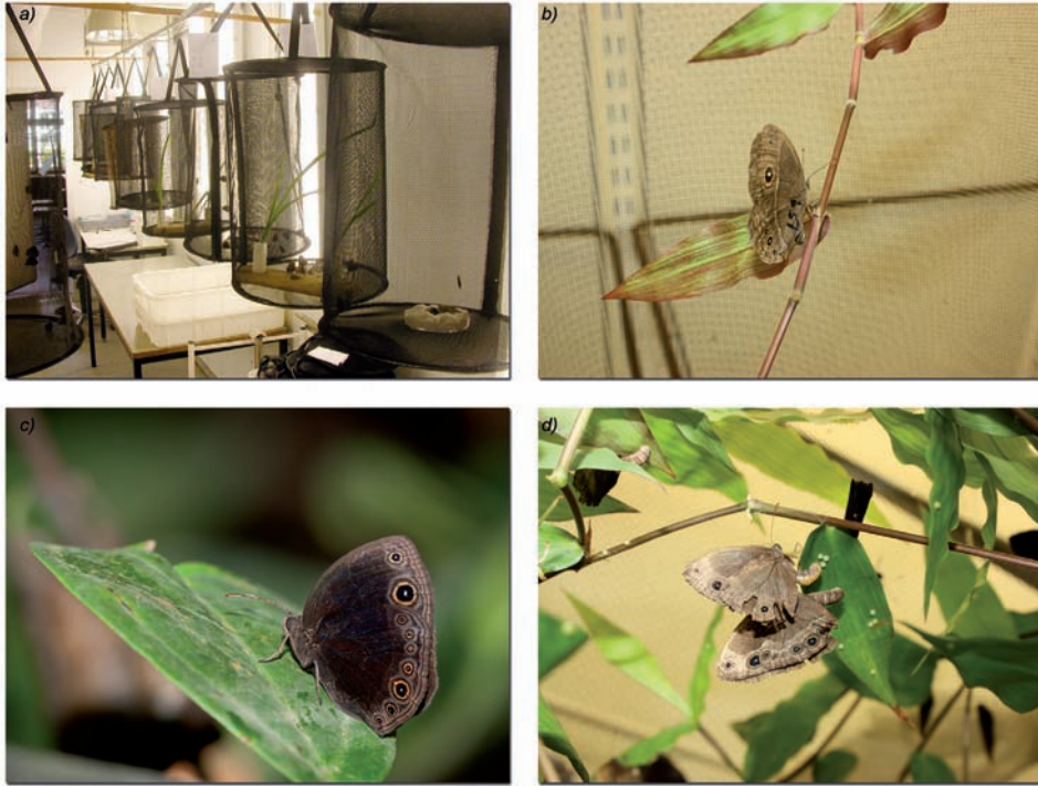
Figure 1. a) Experimental setup for the experiments described in Chapters 4 and 5. b) Female # 6.57 from the experiments described in Chapter 3, at the age of 80 days, 13 days before she died of natural causes. She outlived all her contemporaries, and laid 77 eggs during the first 2 weeks of her life. c) B. martius male in Ologbo Forest, Nigeria during the late dry season. d) B. martius females ovipositing on Oplismenus grasses in the laboratory.

intriguing result in this context is expression data in B. anynana larvae, showing that EcR , coding for the Ecdysone Receptor, is more highly expressed in last instar larvae at high temperatures compared to larvae at low temperatures. However, this difference disappears 24-48 hours before pupation (K. van der Burg and V. Oostra, unpubl. data).