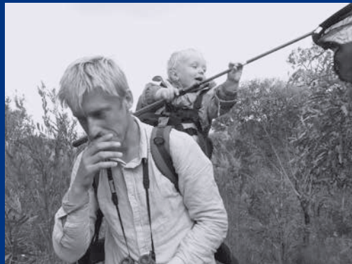
The author contemplating dragonfly evolution while doing field work. Govetts Leap Brook, Blue Mountain, Australia, 29 December 2011.