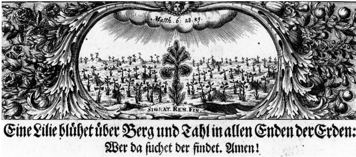
XV. Picture of a lily in Boehme's Theosophia Revelata . From the 1715 German edition in the possession of William Law. J.R. Ritman Library (Bibliotheca Philosophica Hermetica) in Amsterdam, B.P.H., no. 7119-8.