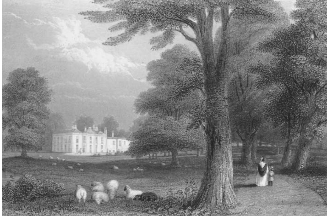
XIII. Lime Grove, home of the Gibbon family in Putney, where Byrom walked with William Law