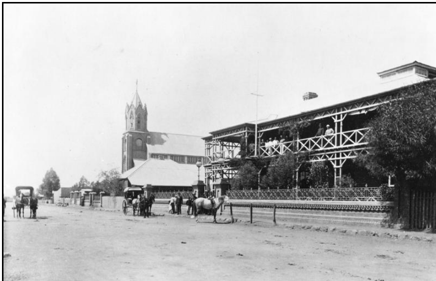
Kimberley Club and St Marys' RC, 1880s