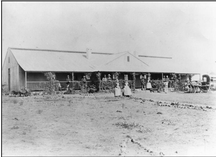
Carnarvon Hospital (McGregor Museum Kimberley Photography nr.4832)