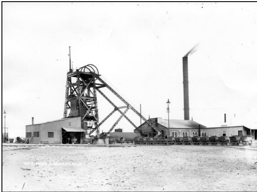
Kimberley Mine, 1893