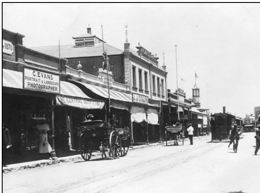
Dutoitspan Road, early 1900s