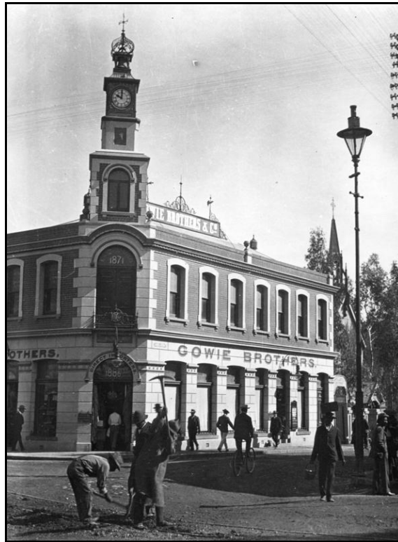
Gowie Brothers & Co, 1890s