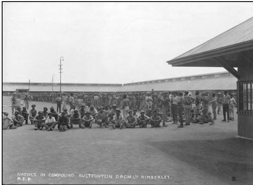
Bultfontein mine compound, 1900s