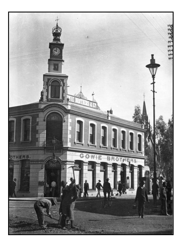
Gowie Brothers & Co, 1890s (McGregor Museum Kimberley photography nr.954_001)