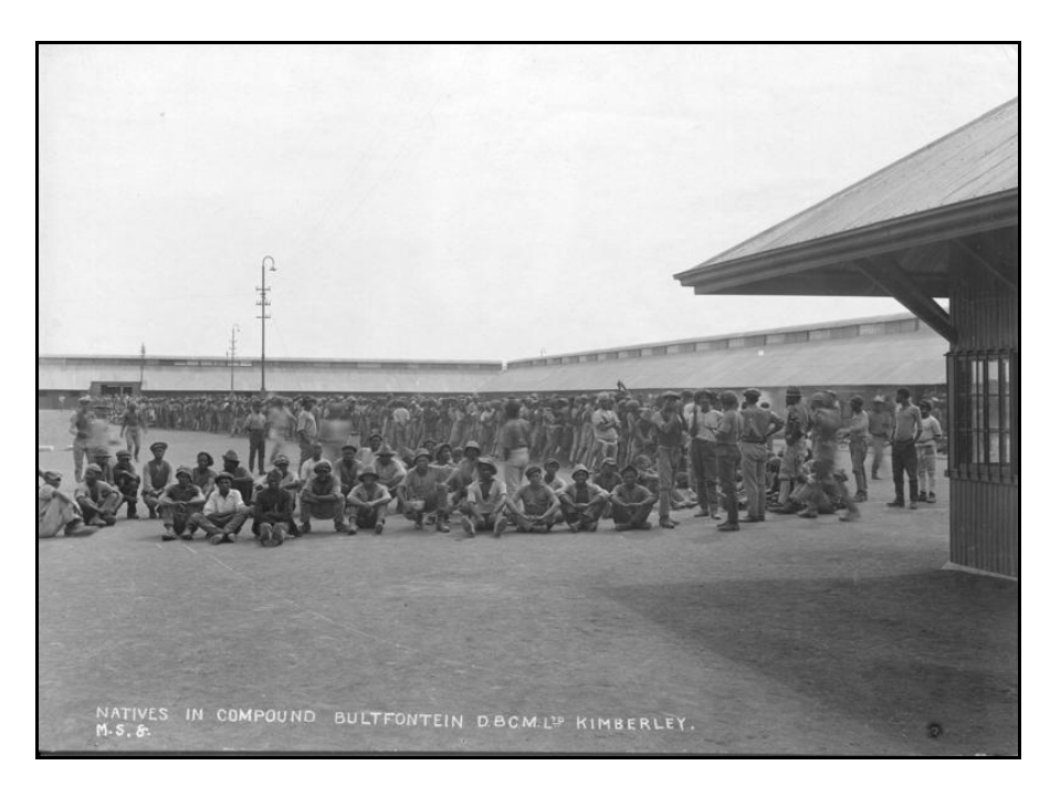
Bultfontein mine compound, 1900s (McGregor Museum Kimberley photography nr.5356)