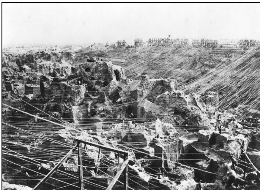
Kimberley mine 1876 (McGregor Museum Kimberley photography nr.7615)