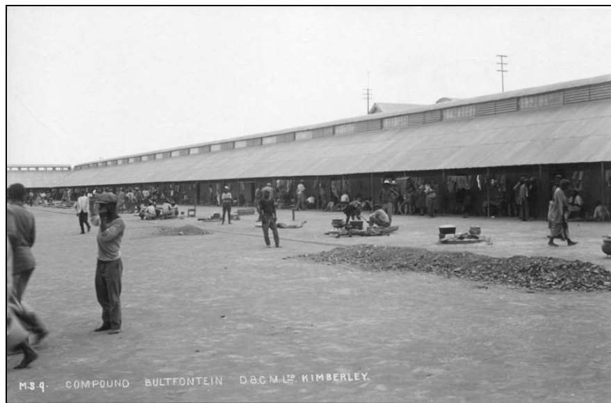
Bultfontein Mine Compound, 1900s