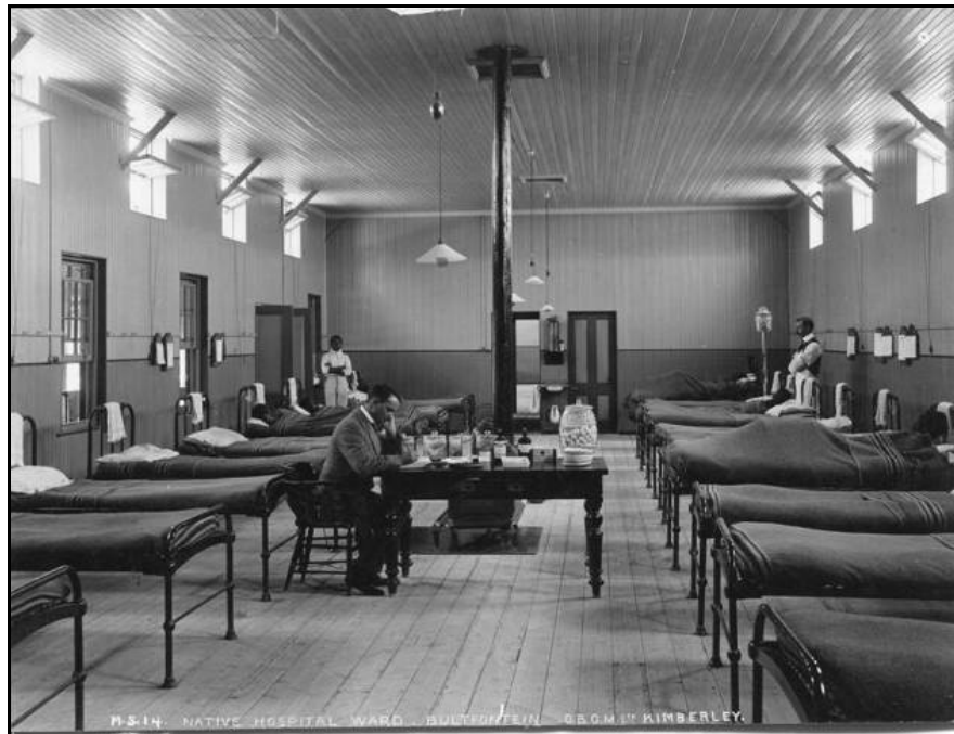
Bultfontein mine compound hospital, 1900s