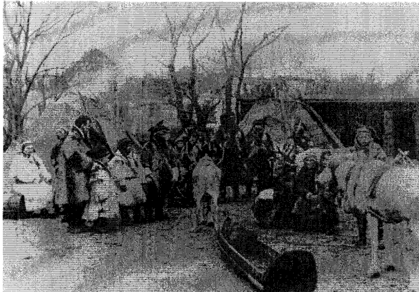
Figure 4 Nomadic Samen or “Laplanders” with reindeers, sleighs, and tents, probably in the zoo of Halle, Germany, c. 1927.

plants, became a popular setting for ethnological exhibits similar to the German ones.