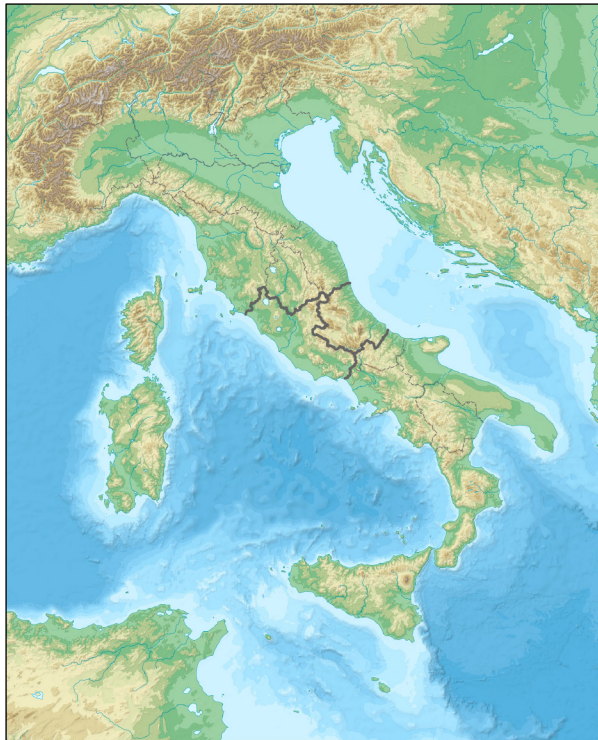
Figure 1.3: map (adapted from http://it.wikipedia.org/wiki/File:Italy_topographic_map-blank.svg ) of the Italian peninsula, highlighting the location of Abruzzo and Lazio with respect to the APENNINE MOUNTAINS.

organisation of cultural landscapes. The ‘retrospective’ presumption is that the geographical scale of the ‘Iron Age model’ is also appropriate for the study of Bronze Age notions of territoriality and central places. However, the scale of the micro-region (or an administrative province) is not such a self-evident starting-point for the reconstruction of Bronze Age landscapes, networks and trajectories. Recent syntheses of the Early and Middle Bronze Ages in Central Italy as a whole (Cocchi Genick 1995, 1998, 2001, 2002) have shown that in these phases notions of territoriality and central places differ considerably from the Early Iron Age (and presumably the Late and Final Bronze Ages). Early and Middle Bronze Age cultural landscapes covered a larger geographical scale than the ‘early state modules’ in the Early Iron Age. Such diachronic differentiation in notions of territoriality demonstrates that the micro-region cannot be regarded as a self-evident unit of analysis. In order to follow trajectories of network changes from the Bronze Age into the Early Iron Age, the analysis has to be scaled up beyond the micro-region of the ‘Iron Age model’.