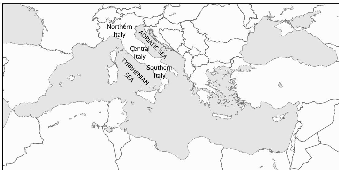
Figure 1.2: map highlighting the central position of the Italian peninsula with respect to Europe, the western and eastern Mediterranean and North Africa (adapted from http://commons.wikimedia.org/wiki/File:Mediterranean_Sea_location_map.svg ).