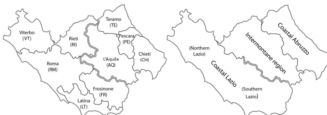
Figure 1.4: map showing (on the left) the constituent administrative provinces of Abruzzo and Lazio and (on the right) the regions used as units of analysis in this study (adapted from http://commons.wikimedia.org/wiki/File:Map_of_Italy_blank.svg ).